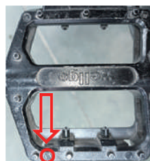
Letters "L" and "R" on the pedal for "left" and "right"