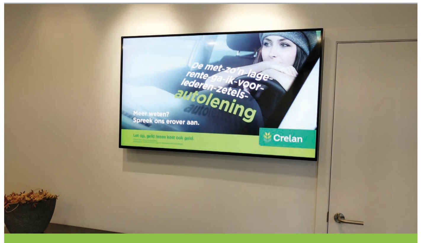
Adaptable 24/7 commercial grade AV monitor with simple digital signage media player