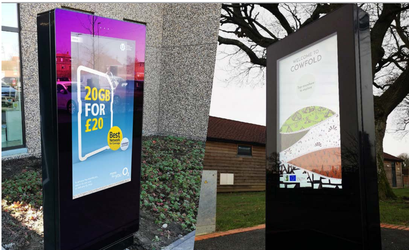
Stunning outdoor totems; perfect for any weather conditions