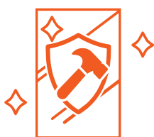
2mm Steel Enclosure 5mm Tough Glass