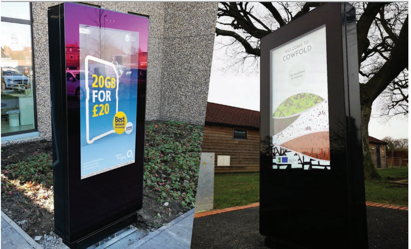
Stunning outdoor totems; perfect for any weather conditions