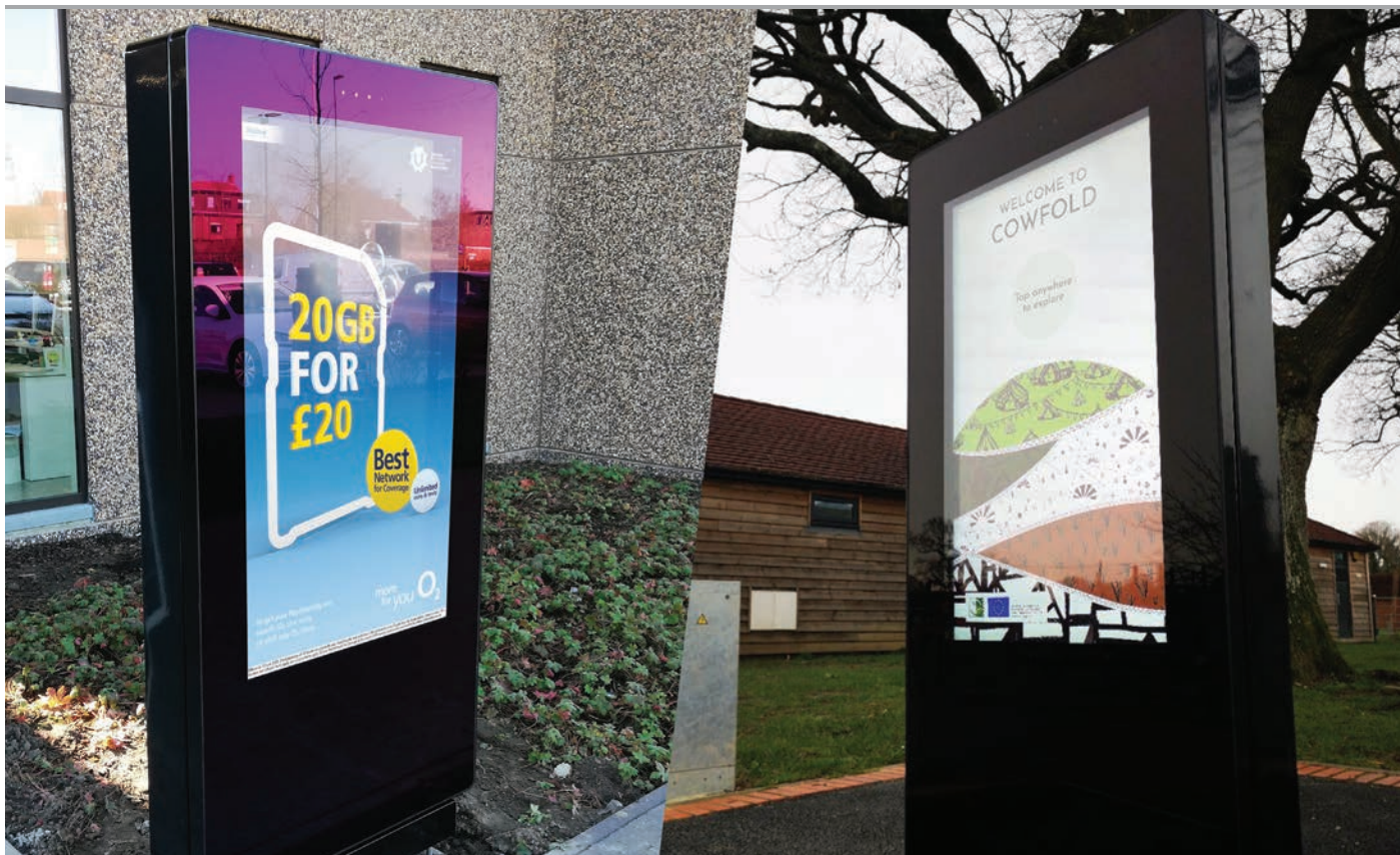
Stunning outdoor totems; perfect for any weather conditions