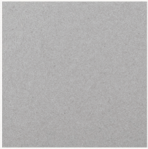
AL2 Satinated Aluminum