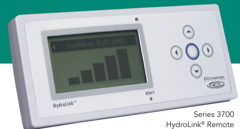
Series 3700 HydroLink® Remote