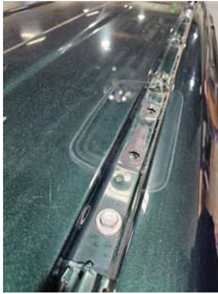
Remove Factory Rack

Rack Feet have stamped triangle arrows to indicate mounting direction and location: