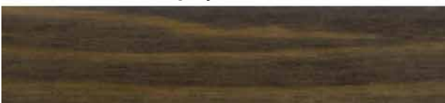
244 - 794 • Agate grey