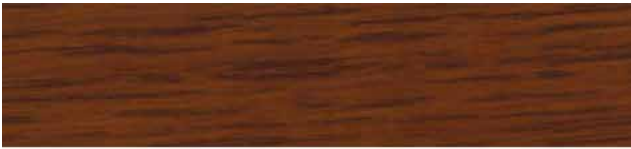
244 - 088 • Smoked oak