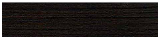
244 - 064 • Dark Walnut