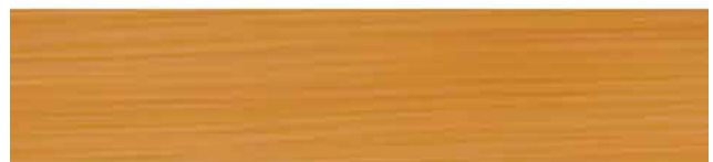
244 - 465 • Cherry