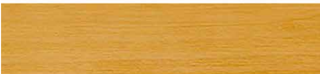
244 - 076 • Oak