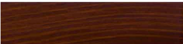
244 - 101 • Black