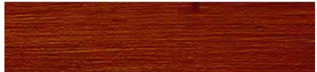
244 - 437 • Black bean