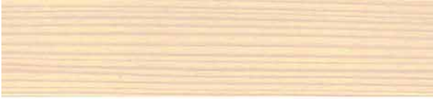
244 - 431 • White oak