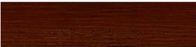
244 - 427 • Elm dark brown