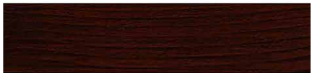
244 - 069 • Tobacco