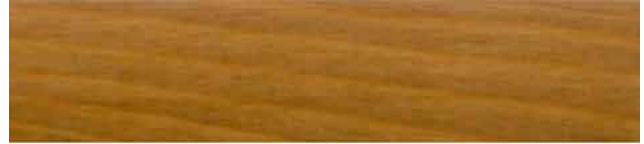
244 - 428 • Cherry honey