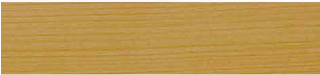
244 - 089 • Antique Oak