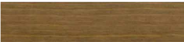
244 - 062 • Walnut