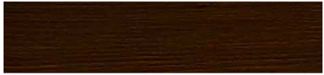
244 - 082 • Rosewood