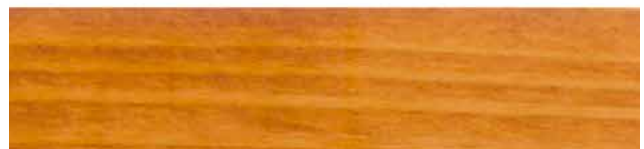
244 - 054 • Mahogany