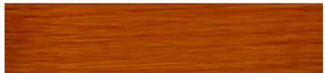
244 - 429 • Cherry intensive