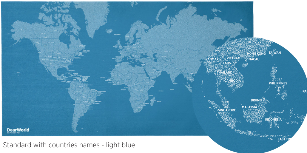
Standard with countries names - light blue