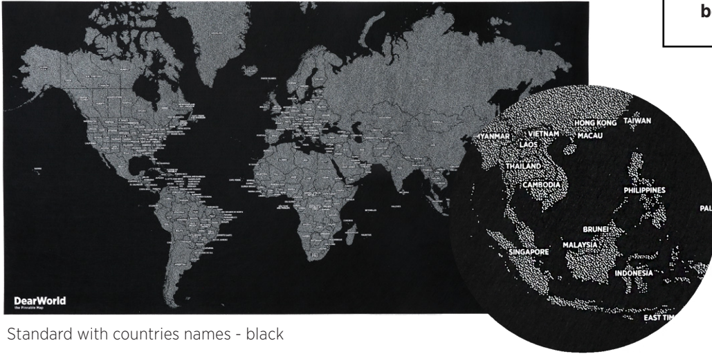
Standard with countries names - black

You can choose between two cartographic options: the map of the world with cities names – and no borders – or the map with countries names and borders.