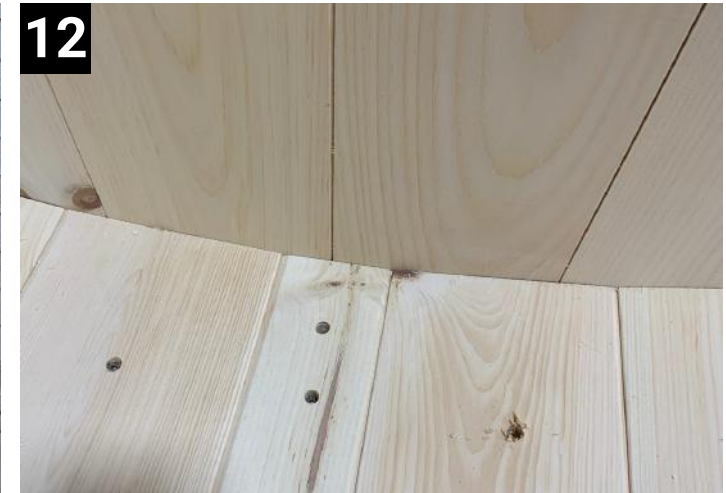
Center wall to Center of stave