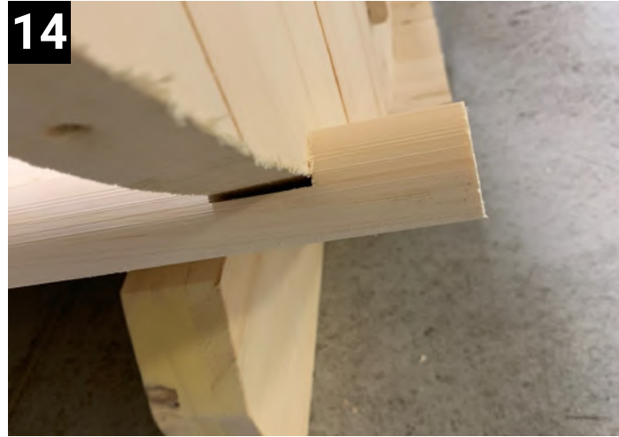
Start putting stave on each side with 3" screws. Do not bury the screw heads