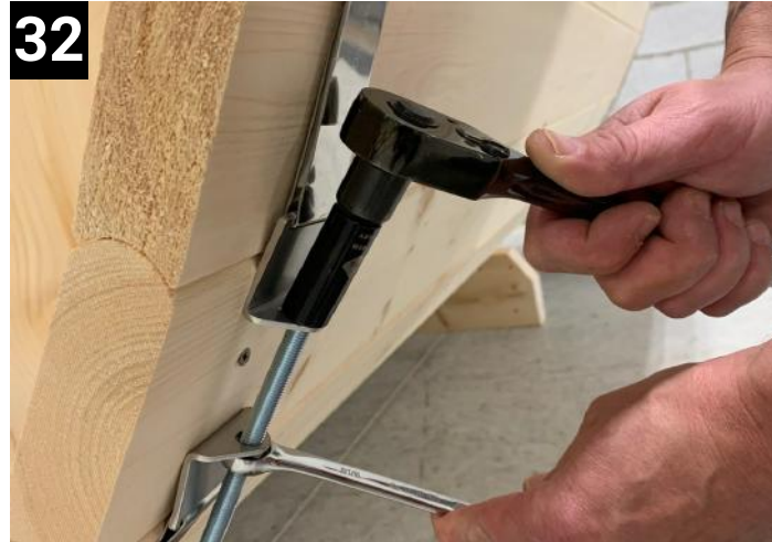
32 Use 9/16" socket wrench and 9/16" combination wrench to tighten.