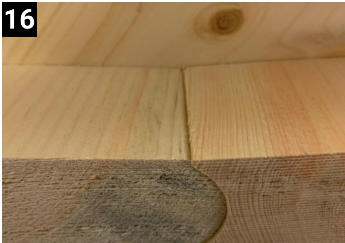
Make sure each stave is tight against the previous stave