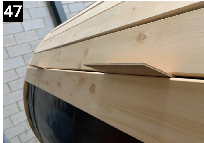
Use 1/4" spacers to put rest of roof boards on