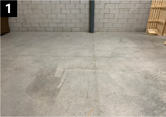
1 Must start with level dry area!