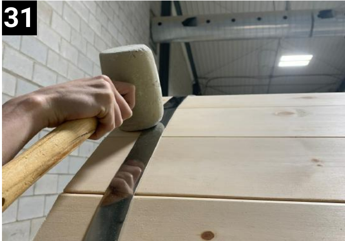
31 While tightening bands hit staves lightly to get even tightness