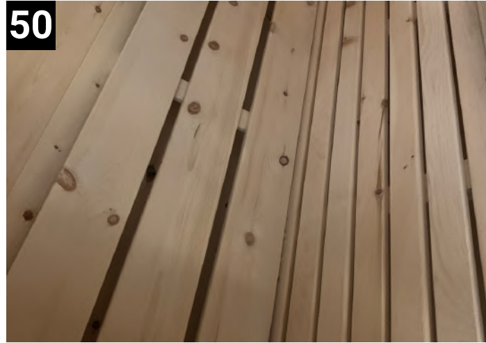
50 Set back rest in and screw in with 3" screws