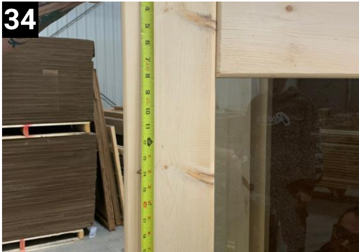
34 21" from top of door to top of handle but also can be your preference.