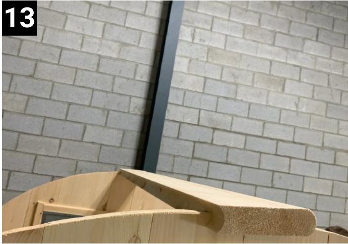
Use 1 stave for safety so walls don't fall