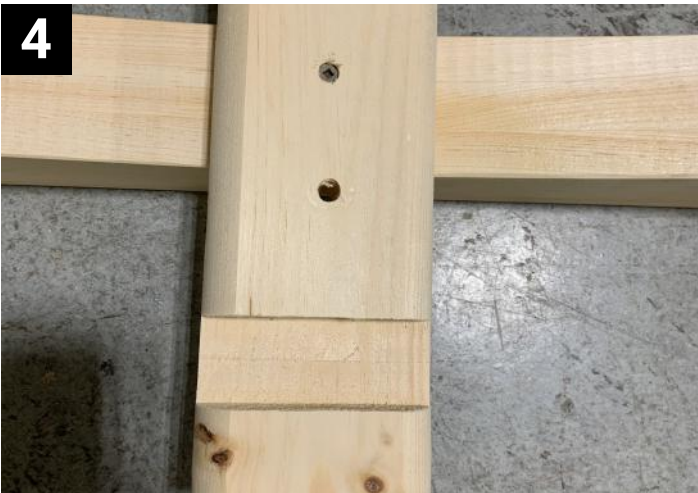
4 Put bottom, stave with 2 round sides and Center it on cradle, 6" from end and secure with 3" screw. Drain hole is still open