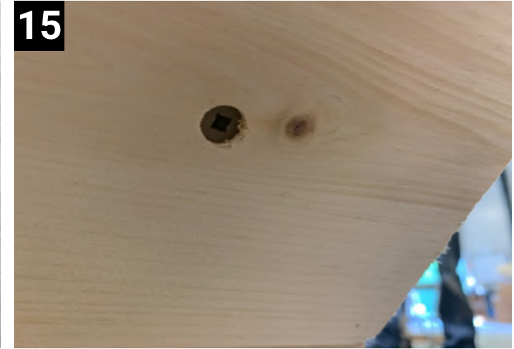
Just put screw in as deep as shown. Bands will pull in rest tight later in process