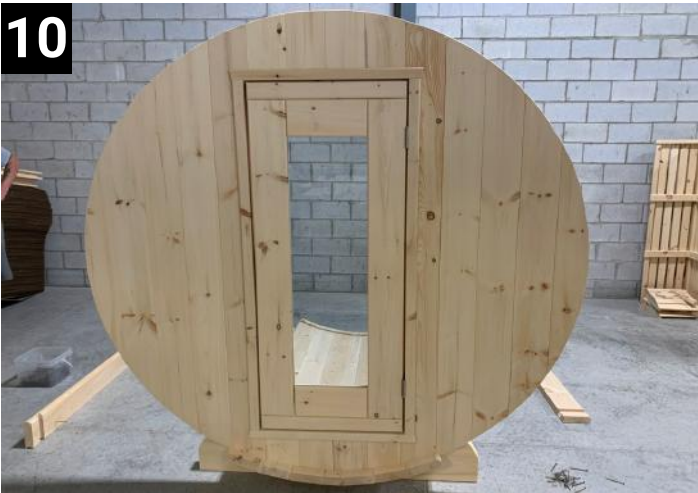
Front wall finished. Make sure it does not fall at this point