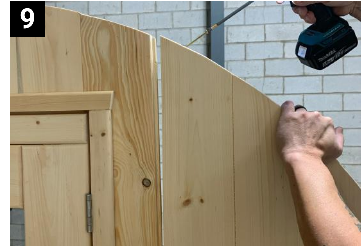
Screw right front wall and left front wall into place to finish front wall