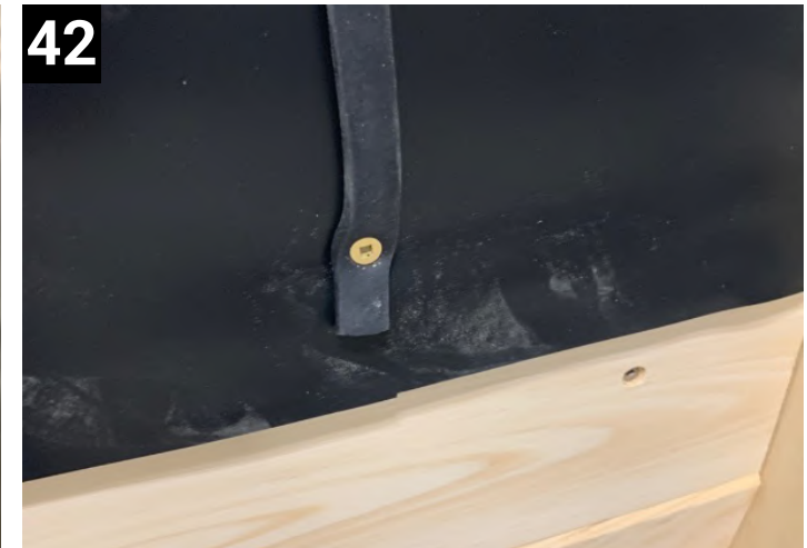
neoprene strips equal height off ground on both sides over the black plastic not onto wood. Then roof boards.