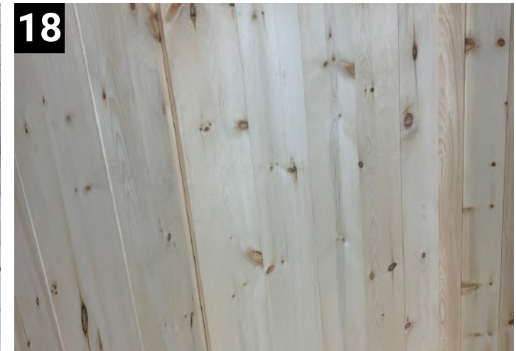
Put assembled floor in