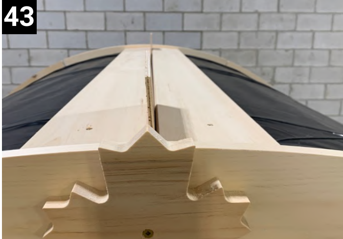
Center top 2 roof boards on Sauna