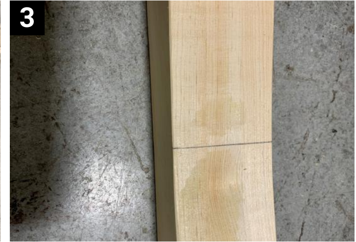
3 Find Center point of cradle. VERY IMPORTANT that first stave is same in each cradle.