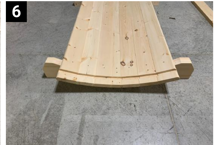
6 Secure 3 left staves and 3 right staves in cradle with 3" screws. Make sure they are tight against each other