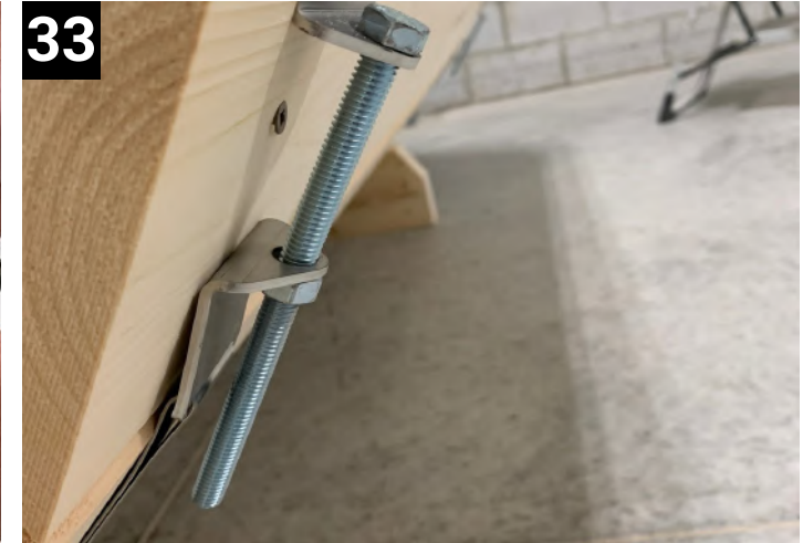
33 Do not over tighten to point of bending bolts.