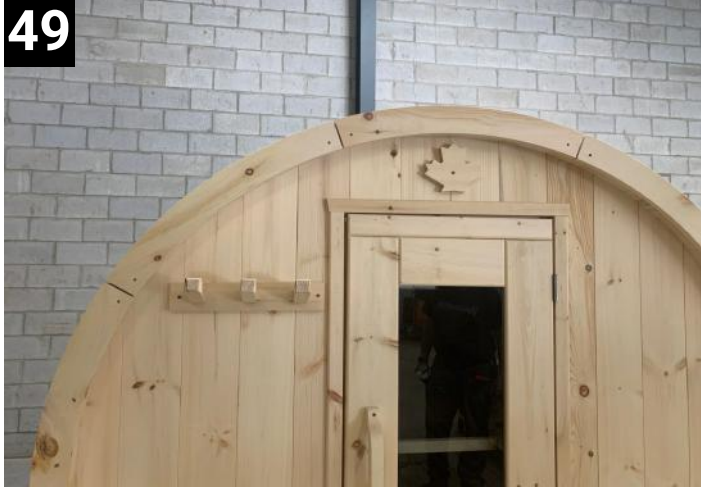
49 Screw towel hook on and maple leaf on with 1 3/4" screws.