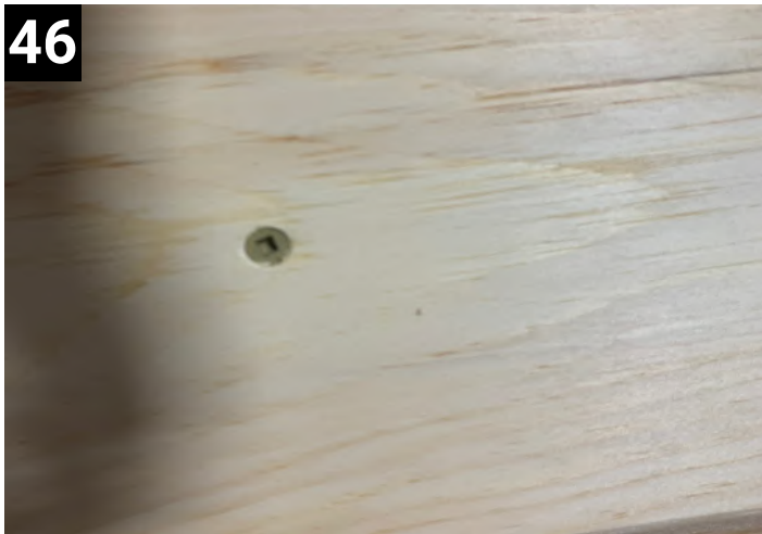
Put one screw in at each end so screw goes through neoprene strip and into roof stave. Keeps water seal