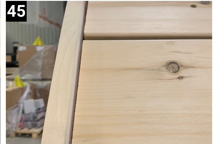
Keep end of boards equal space to look nice