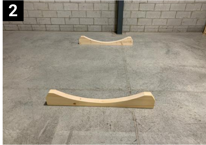
2 Put cradles on ground