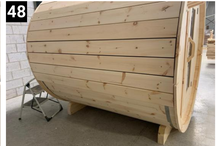
Roof boards come down and cover roof membrane on both side for a nice look