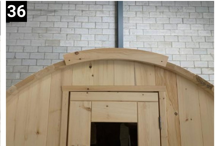
36 Center top bargeboard and screw on with 2" screws.