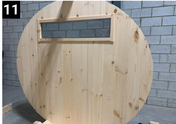
Assemble back wall like you did on front wall with the 4" screws to connect