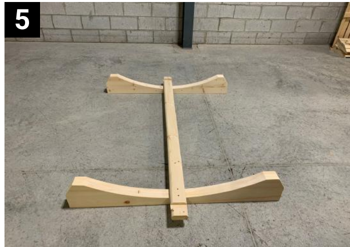
5 Do same at both ends. Stave must be centered.