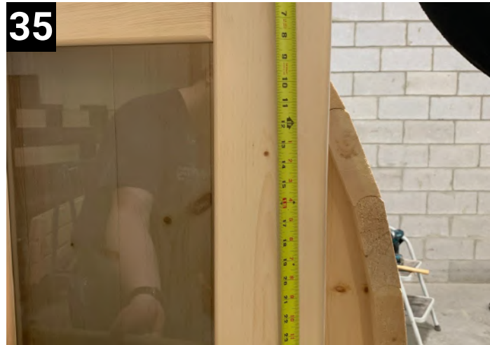
35 Inside handle goes across door at around 26" height from top of door. Can use this as towel bar inside.