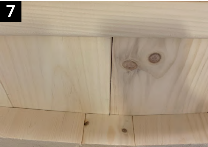
Center door and insert into dado