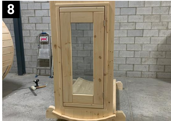
Door should be straight