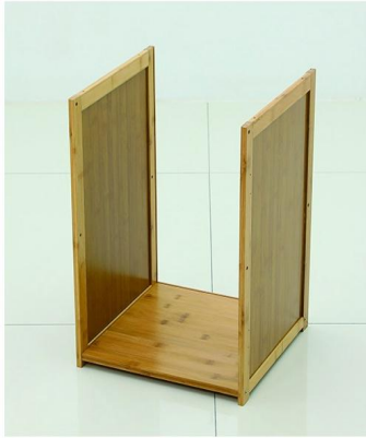
Step 1: Take out the bottom board and the side board and install them with large screws on the left and right sides. (Align the bottom board and side board grooves)