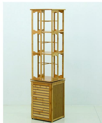
Step 9: Finally, take out the bars and insert them one by one