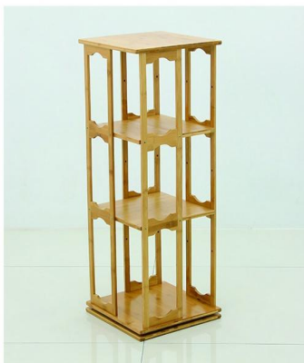
Step 7: Take out the middle layer B and the top layer and install them with large screws