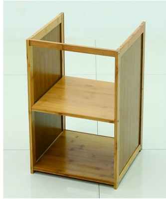
Step 2: Take out the front rail and middle layer A and install them with large screws