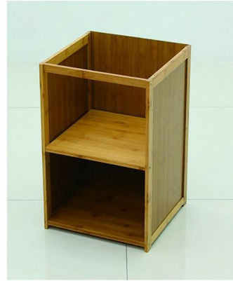
Step 3: Take out the back plate and insert it along the groove