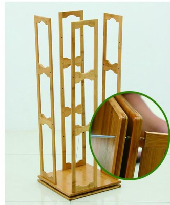
Step 6: Take out the bracket and install the rotating shelf with large screws