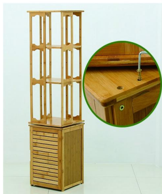
Step 8: Then fix it with large screws as shown in the picture