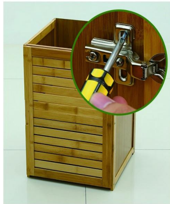
Step 5: Then use small screws to install the door panel to the bracket