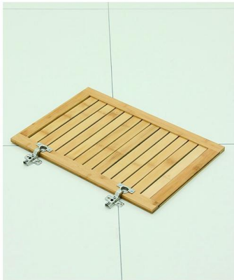
Step 4: Take out the hinges and door panels and install them with small screws