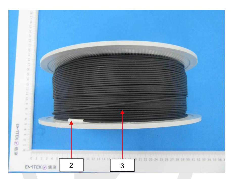
*** End of Report *** 报告结束

No.: EGZ2209050063C00314R Date: Oct. 26, 2022 Page 9 of 13