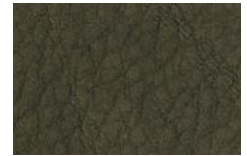
1701 - caqui