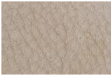
1719 - kangaroo