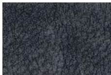
1721 - ematite