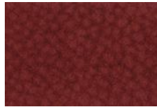
1714 - lucky