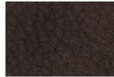
1704 - chocolate forest