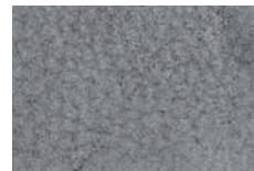
1710 - plomo