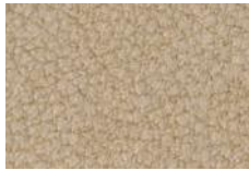
1716 - doeskin