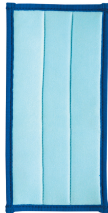
Part# eGLASS B10

The 4D Cleaning™ eTROWEL® is outfitted with a powerful black light or LED light. The rechargeable battery provides exceptional power 10 hour run time (black light) and 30 hour run time (LED white light). Recharges in 4 hours.