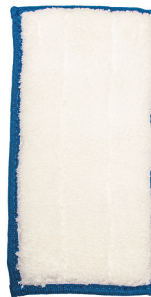
Part# eSNOW B10