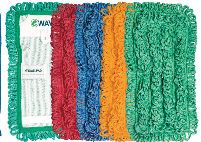
Part# eTROWELPADR (red) eTROWELPADB (blue) eTROWELPADY (yellow) eTROWELPADG (green)