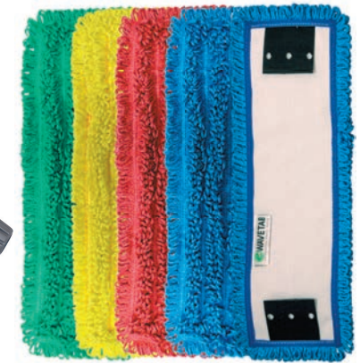
Part#s WAVETABB18 (blue) WAVETABR18 (red) WAVETABG18 (green) WAVETABY18 (yellow)