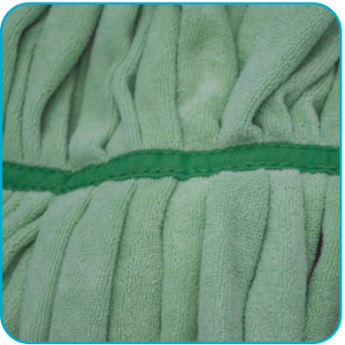
Color Coded Band

Premium Tube mops incorporate scrubber heads on both sides of the 7” head.