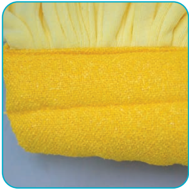
Durable Scrubber Head

The 4D Cleaning™ premium TUBE mops are a fantastic replacement for the traditional cotton string mop. They feature large, tubular microfiber construction to tackle heavy soil with no exposed seams to ensure longevity, a 7” scrubber band at the top for removing hard to clean debris and a sewn in band along the bottom to maintain the mops structural integrity.