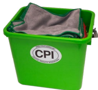
CPI PTMINI = microfiber cloths and trowel pads