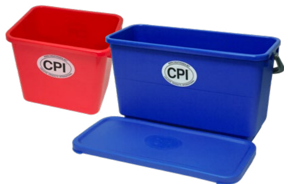
CPI PreTreat buckets