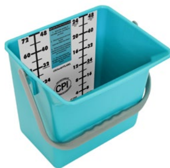
CPI solution bucket

1 Gather Your Supplies — Select the individual CPI PreTreat, sealing bucket(s), the CPI solution bucket and the CPI Microfiber Mops, Pads or Cloths needed for your cleaning task(s).