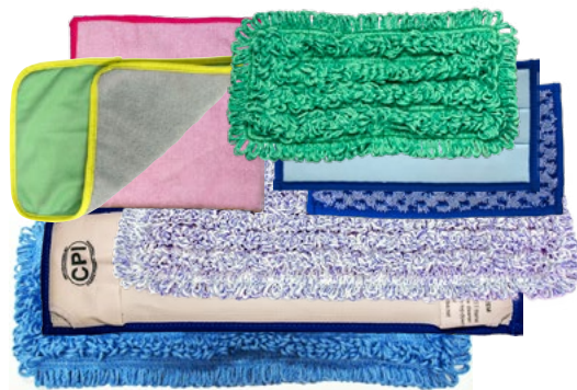
CPI Microfiber mops, pads or cloths

Lay the CPI microfiber cleaning side down inside the PreTreated bucket(s).