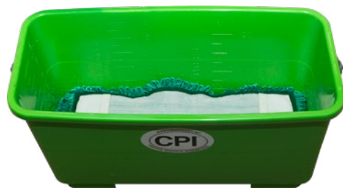
CPI PTBUCKET = 18" microfiber mops

Lay the CPI microfiber cleaning side down inside the PreTreated bucket(s).