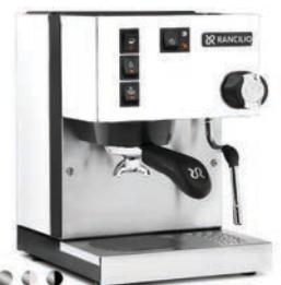
PRODUCT CODE: E01R312N