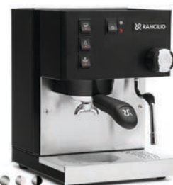
PRODUCT CODE: E01R310N