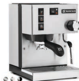
PRODUCT CODE: E01R311N