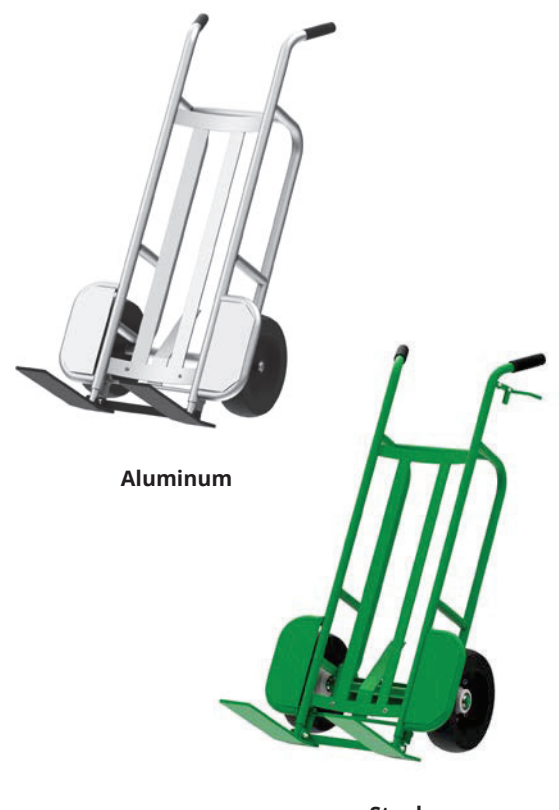
Steel Hand Brake