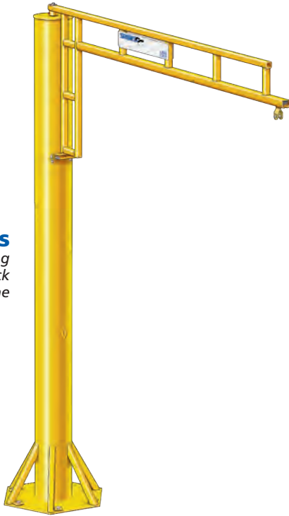
500 Series Freestanding Enclosed Track Workstation Jib Crane