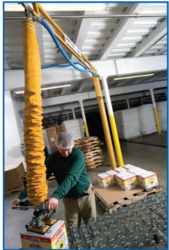
A worker stacks boxes of packaged food onto a pallet using a Spanco 150-Pound Capacity Freestanding Workstation Jib Crane with a vacuum attachment.