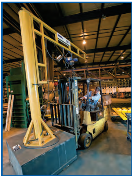
Freestanding Workstation Jib Crane with Portable Base