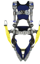
Oil and Gas