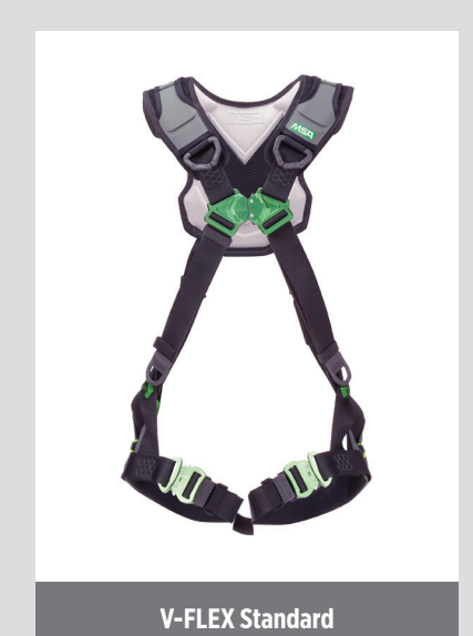
V-FLEX Standard Full-Body Harness