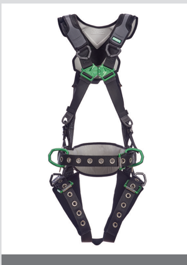
V-FLEX Construction Full-Body Harness