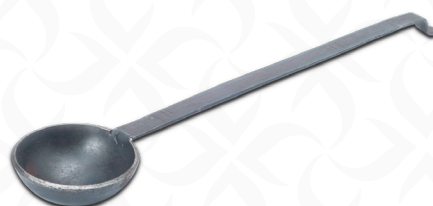
Pure Iron Tadka Ladle