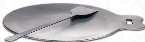
Heavy weight Iron Tawa