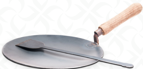
Light weight Iron Tawa

Iron or Cast iron Tawa: Heavier tawas are multi-purpose in usage and can be used for making Roti, Dosa, Paratha, Puran Poli, etc. The lighter ones are usually for chapatis.