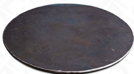
Pure Iron Seasoned Sengottai Dosa Kallu