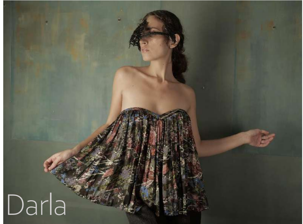
Presenting DARLA Printed Top with trouser.