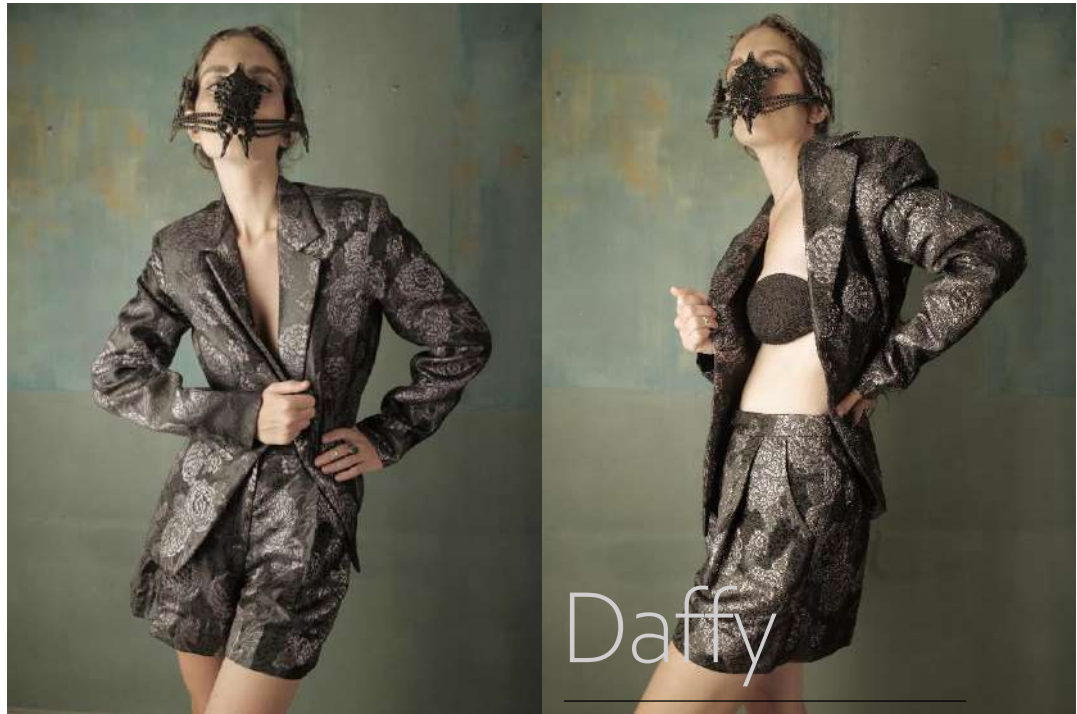
Featuring DAFFY Brocade paper bag shorts and black lace bustier.