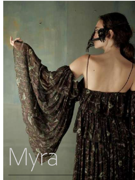
Featuring MYRA dress in printed lurex dobby fabric with ruffles detail.