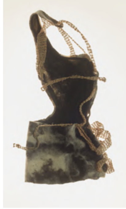
004 - 39 ASSIMETRICAL FELT DRESS 100% ALPACA FELT 100% HEMP CROCHET HANDMADE