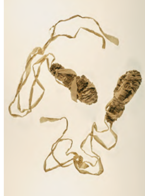
003 - 47 THICK FLIP FLOPS 100% COTTON CALICO 100% HEMP