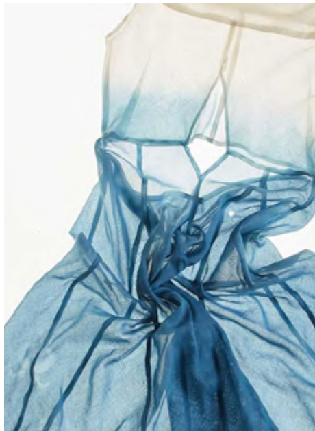
004 - 63 INDIGO DRESS 100% EGYPTIAN COTTON MUSLIN 100% INDIGO DYED