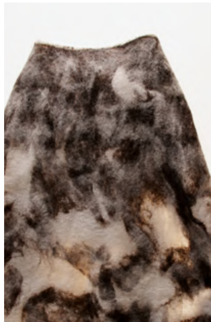
004 - 18 FELT SKIRT 100% ALPACA FELT 100% COTTON CROCHET CORD HANDMADE