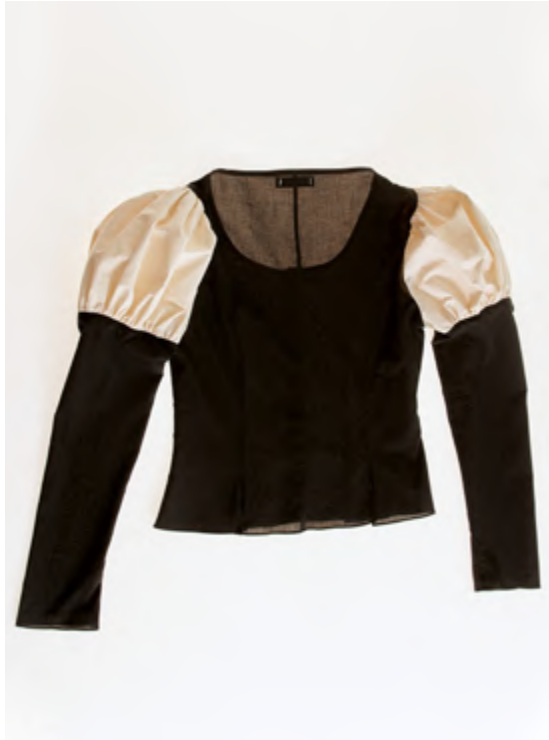
004 - 10 DAMA SHIRT 100% COTTON CALICO 85% RECYCLED COTTON 15% RECYCLED LINEN 100% HANDMADE SEAWEED BUTTONS