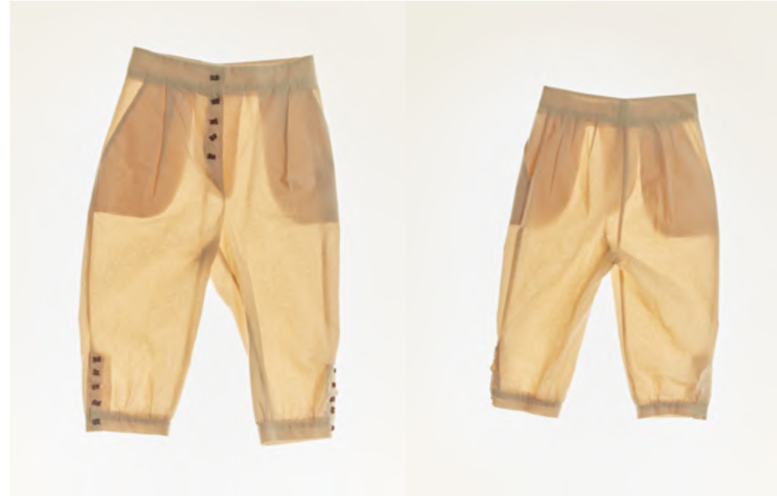
004 - S - 11 UNIFORM SHORTS 100% COTTON CALICO 100% SEAWEED BUTTONS