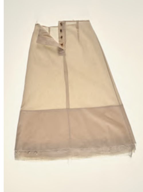
003 - 26 LAYERED SKIRT 100% COTTON CALICO 100% UPCYCLED COTTON 100% SEAWEED BUTTONS