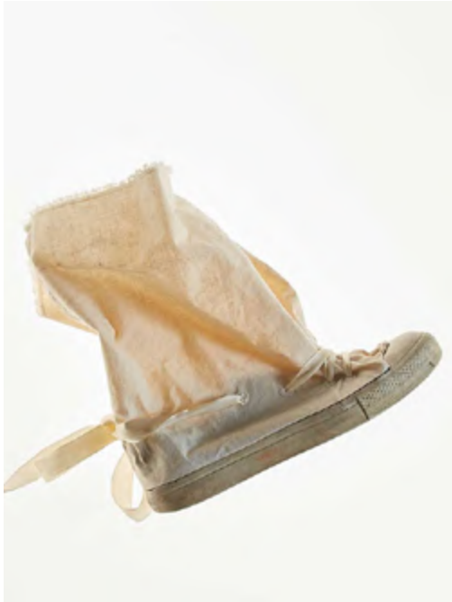
004 - 61 ALTERED CONVERSE 100% COTTON CALICO 100% POLYESTER LACE