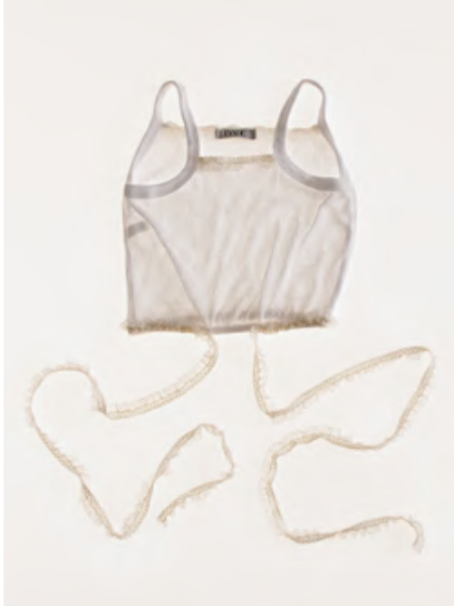
004 - C - 01 BRA TOP LACE 100% COTTON CALICO 100% POLYESTER LACE