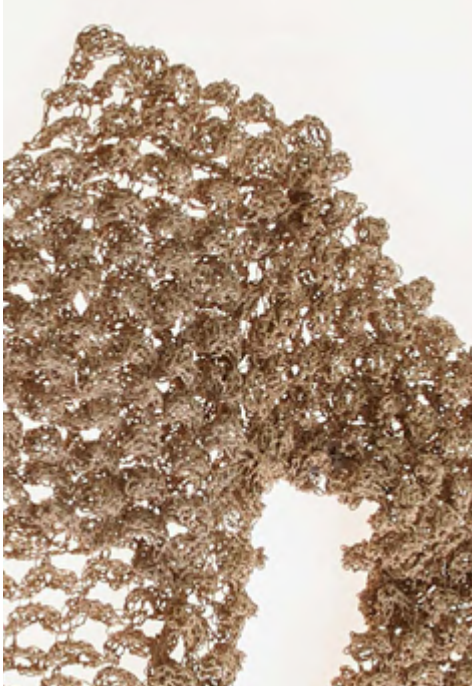
004 - 06 CUT OF SLEEVE TOP HANDMADE CROCHET 100% HEMP