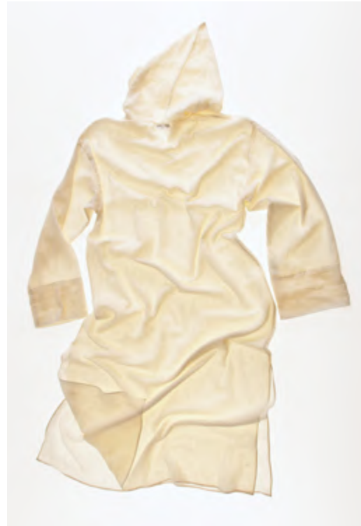
| 004 - 15 MONK DRESS | 100% EGYPTIAN COTTON MUSLIN