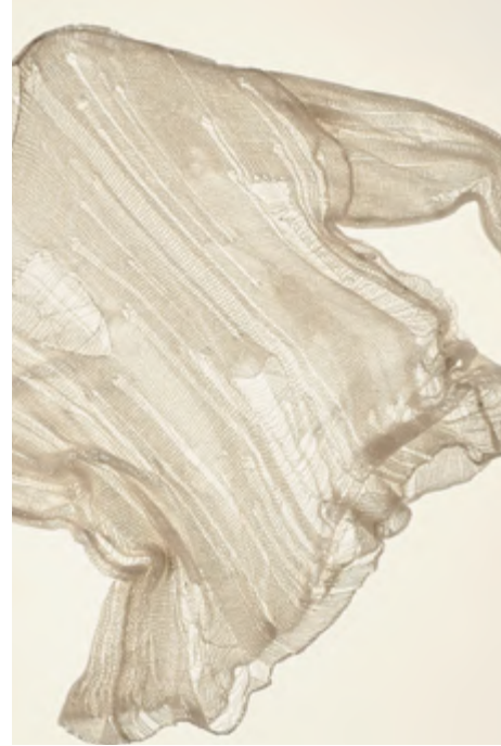
003 - 36 KNIT JERSEY 100% COTTON