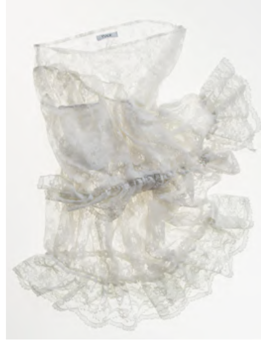
004 - S - 05 MIRANDA SKIRT 50% COTTON LACE 50% POLYESTER