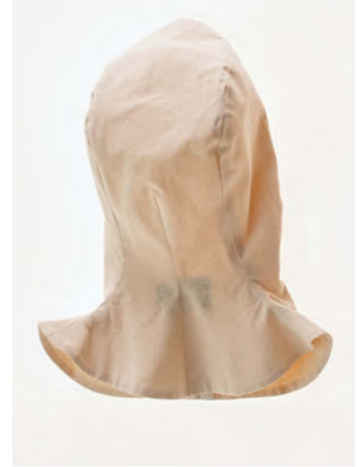
004 - 03 MEDIEVAL BUCKET CALICO - 100% LIGHT COTTON / 100% SEAWEED BUTTONS