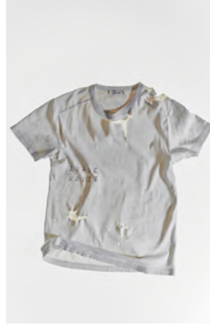
004 - G - 77 100% COTTON 100% HAND INK SIGNATURE