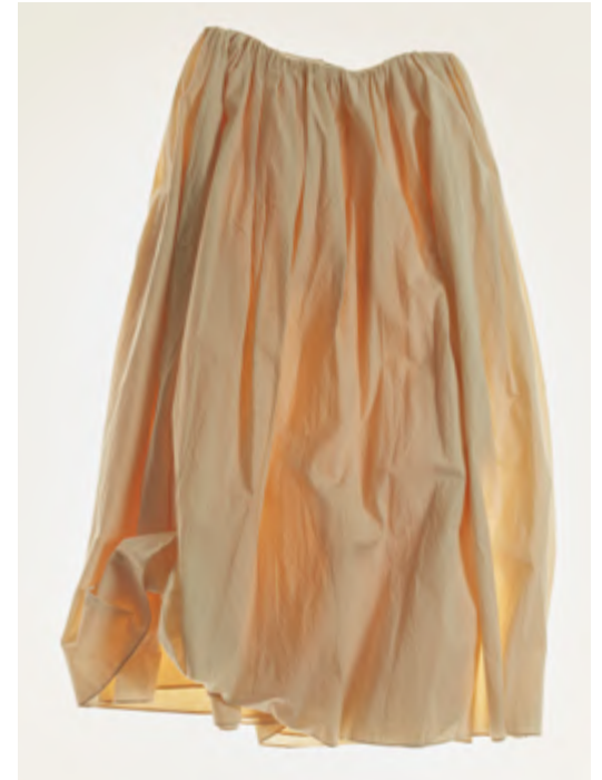
| 004 - 25 LOW WAIST SKIRT 100% COTTON CALICO 100% SEAWEED BUTTONS