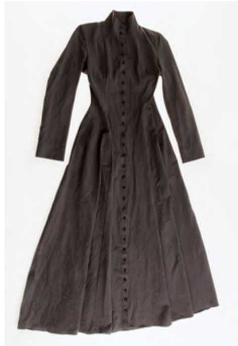
004 - 04 BUTTON GREY JACKET DRESS

MIKKUSU - 85% RECYCLED COTTON / 15% RECYCLED LINEN / 100% SEAWEED BUTTONS