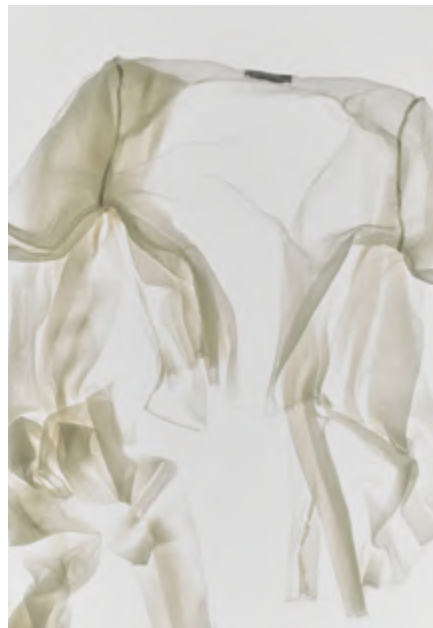
004 - S- 11 JELLY SHIRT 100% ORGANIC COTTON