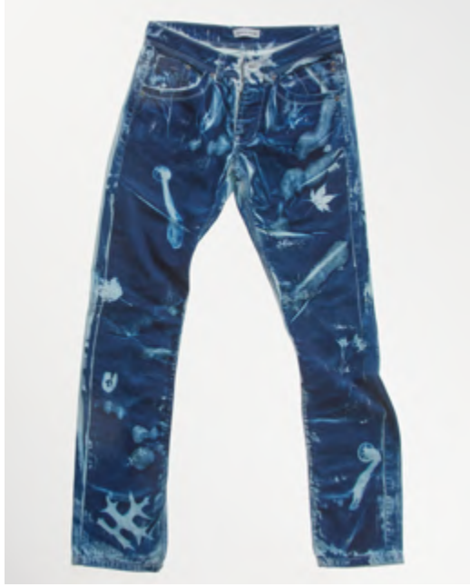
004 - 26 CYANOTYPE TROUSERS 100% UPCYCLED COTTON 100% MINERAL DYE