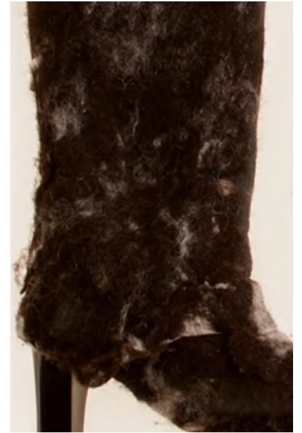
004 - 63 FELTED BOOTS 100% HANDAME ALPACA WOOL FELT