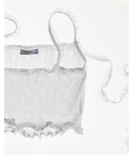
| 004-C-07 LACE TANK TOP 100% COTTON 100% POLYESTER LACE