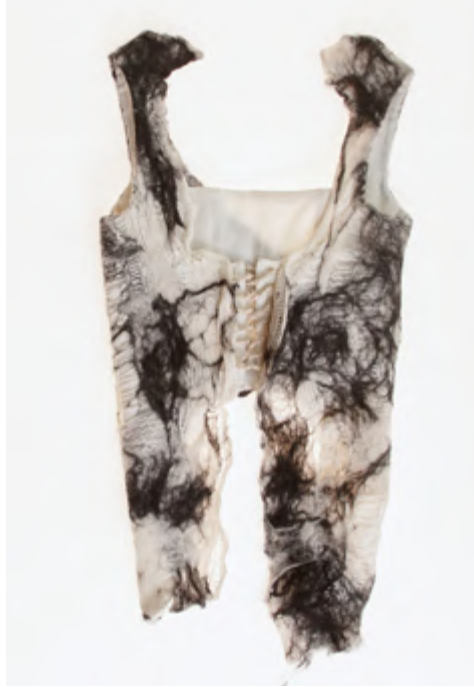
004 - 08 FELT LAPEL CORSET 100% ALPACA WOOL HANDMADE FELT 100% ORGANIC COTTON LINING