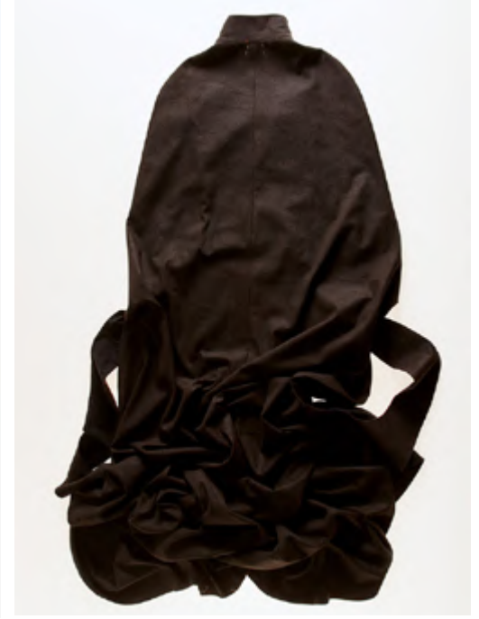
004 - 23 TALE CAPE 100% MUD CLOTH 100% COTTON THIS IS A MEDIUM-WEIGHT COTTON CANVAS DYED USING MUD

* The mud is applied by hand and then dried in the sun. The fabric is stored inside for 6 months to fix the colour and then washed and sun-dried once again. As with most natural dyeing, it is difficult to produce in the rainy season which means it can take up to a year to complete the process