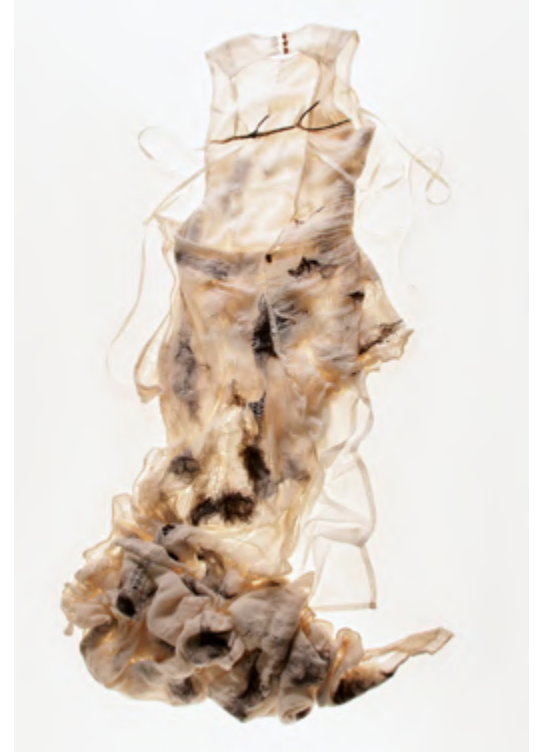
004 - 16 TALE MOI DRESS 100% ORGANIC COTTON 100% ALPACA WOOL