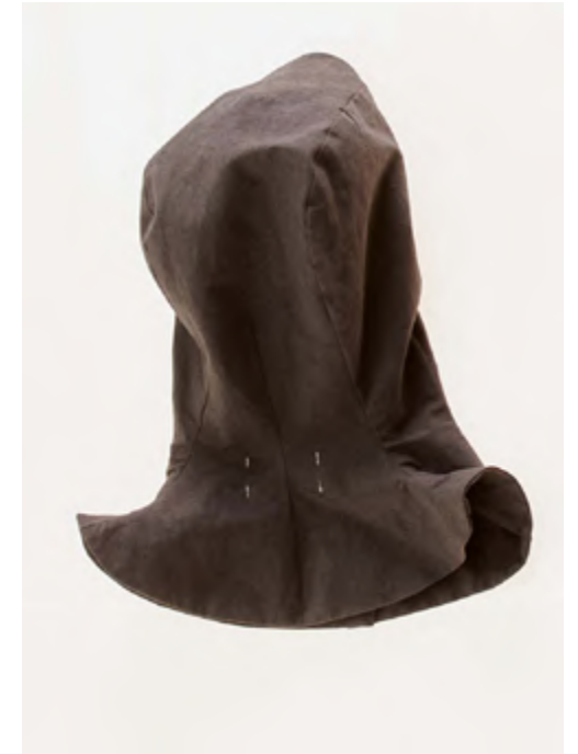
004 - 05 MEDIEVAL GREY BUCKET

MIKKUSU - 85% RECYCLED COTTON / 15% RECYCLED LINEN / 100% SEAWEED BUTTONS