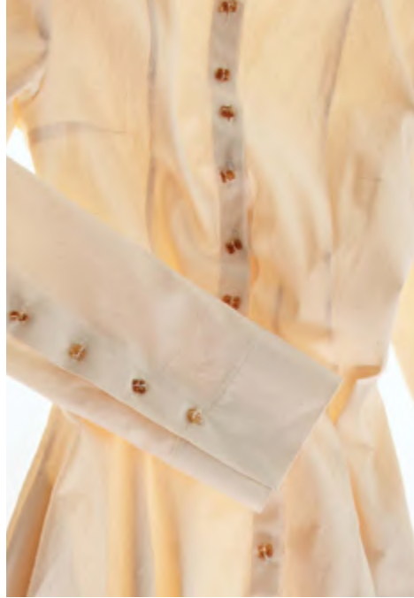
004 - 02 BUTTON CREAM JACKET DRESS CALICO - 100% LIGHT COTTON / 100% SEAWEED BUTTONS