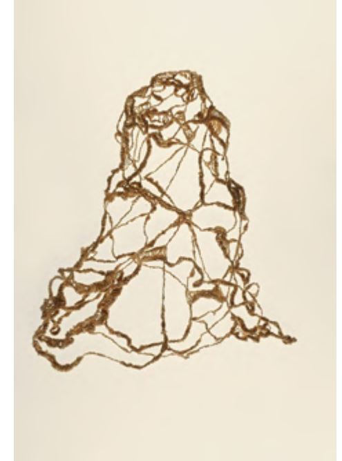
003 - 77 LONG SPIDER WEB 100% SEAWEED WOOL