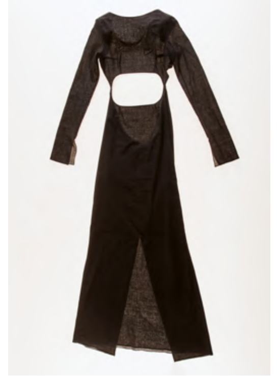
004 - 22 NIGHT DRESS 100% ORGANIC COTTON