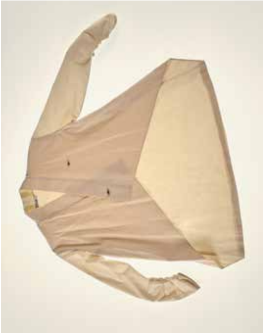
003- 29 CAPE COAT

100% CALICO / 100% SEAWEED BUTTONS ONE SIZE ONLY - MEDIUM