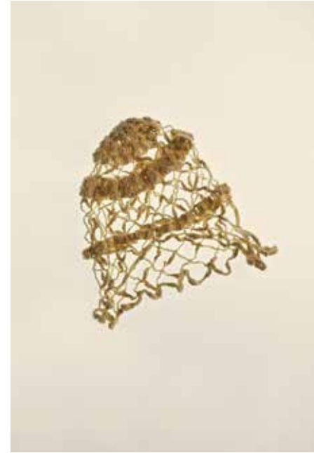
003- 52 VEIL HAT