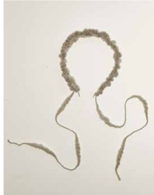
003- 05 ISABELLINA HAIRBAND

100% CALICO / 100% SEAWEED BUTTONS ONE SIZE ONLY - SMALL