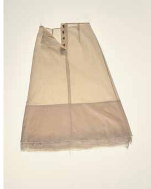
003- 26 LAYERED SKIRT

MIKKUSU JAPANESE FABRIC 85% RECYCLED COTTON 15% RECYCLED LINEN 100% SEAWEED BUTTONS ONE SIZE ONLY - MEDIUM