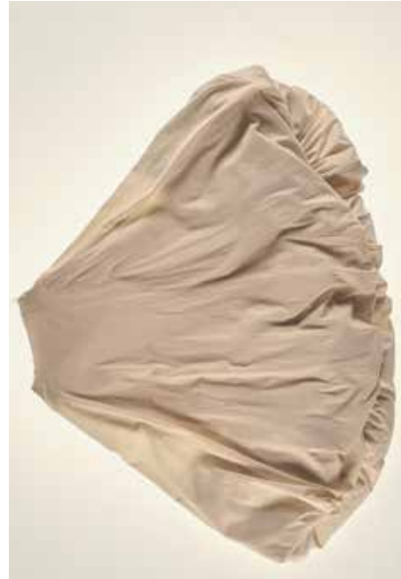
003- 28 PAPER SKIRT

100% CALICO / 100% SEAWEED BUTTONS ONE SIZE ONLY - SMALL