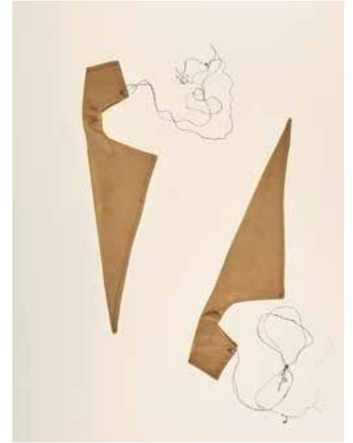
003- 43 VENICE SHOES

100% CALICO / 100% HEMP CORD ART PIECE - DELICATE