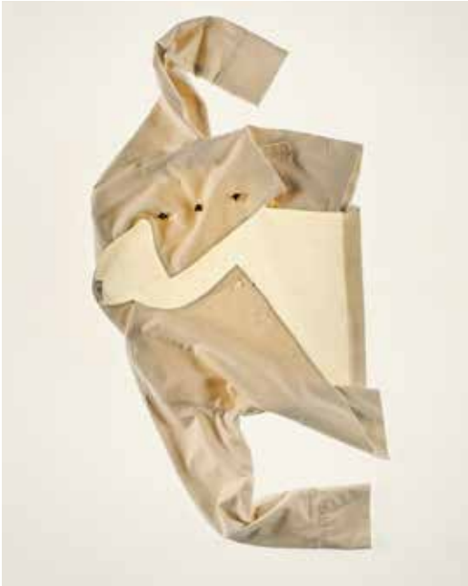
003- 20 CROSS CARDIGAN