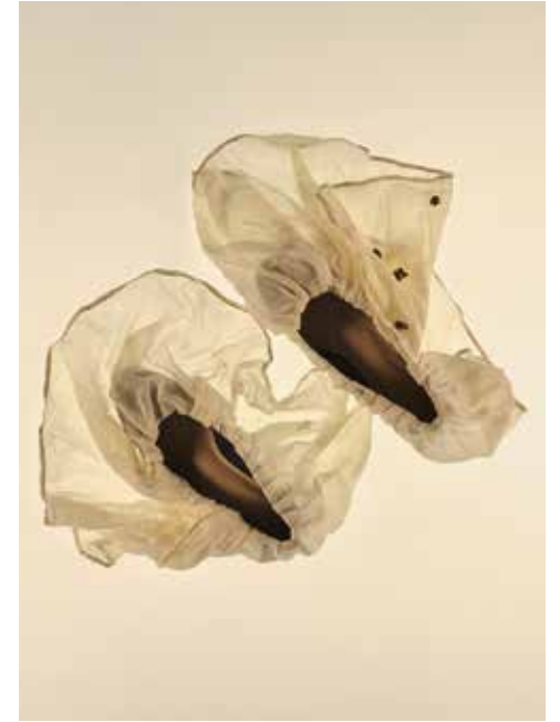
003- 44 SECRETARY SHOES

100% HEMP / 100% COTTON ONE SIZE FITS ALL