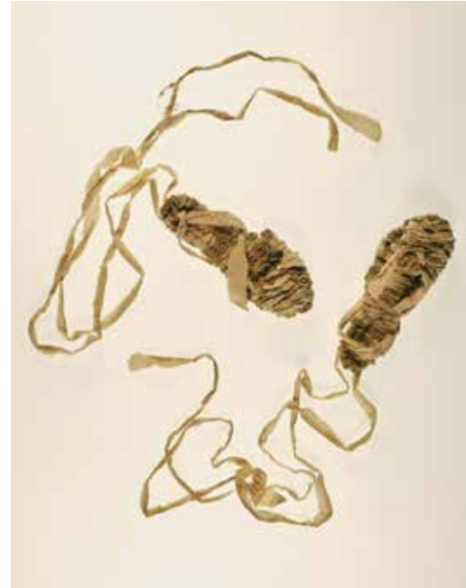
003- 40 THICK FLIP FLOPS

100% CALICO /100% ALPACA WOOL ONE SIZE ONLY