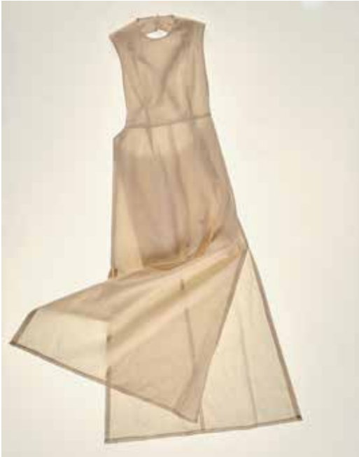
003- 23 CROCHET BACK DRESS

100% CALICO / 100% SEAWEED BUTTONS ONE SIZE ONLY - SMALL