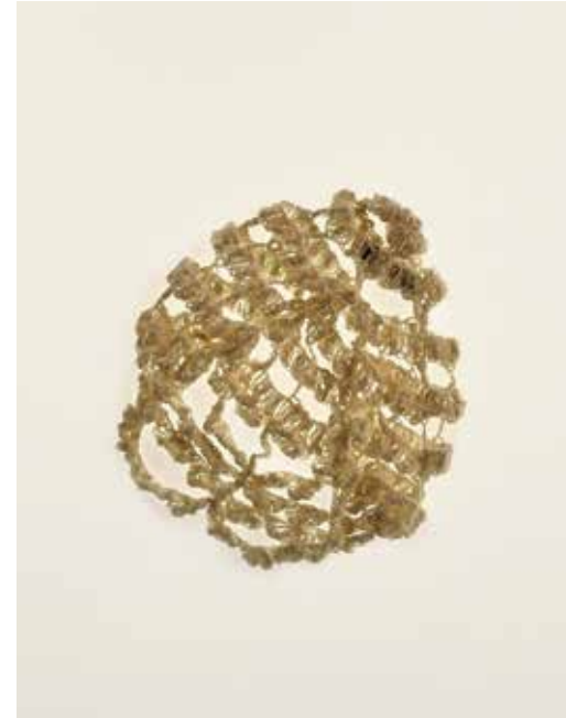
003- 53 WHISKERS HAT