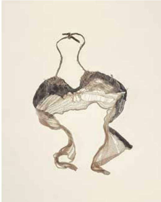
003- 38 KNIT SCARF TOP