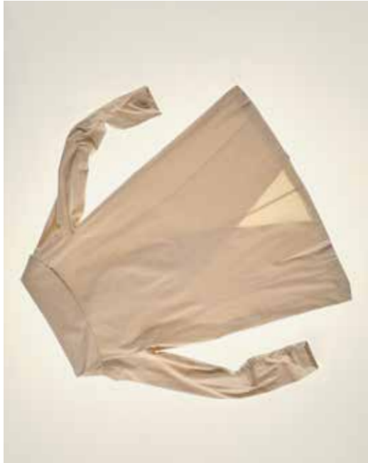
003- 29 CAPE COAT

100% CALICO / 100% SEAWEED BUTTONS ONE SIZE ONLY - MEDIUM