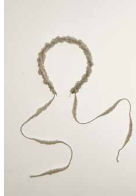
003- 05 ISABELINA HAIRBAND