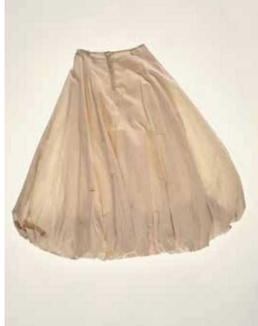
003- 25 WINE SKIRT