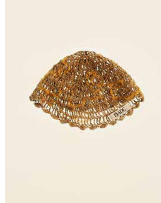
003- 49 YELLOW DATA BONNET

100% HEMP / 100% COTTON ONE SIZE FITS ALL