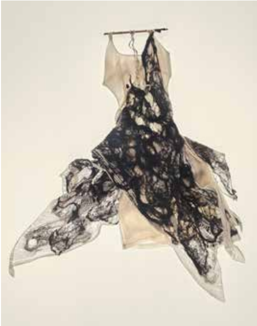
003- 09 FELT WOOD DRESS

100% ALPACA WOOL / 100% COTTON / 100% WOOD STICK ONE SIZE ONLY - SMALL / MEDIUM