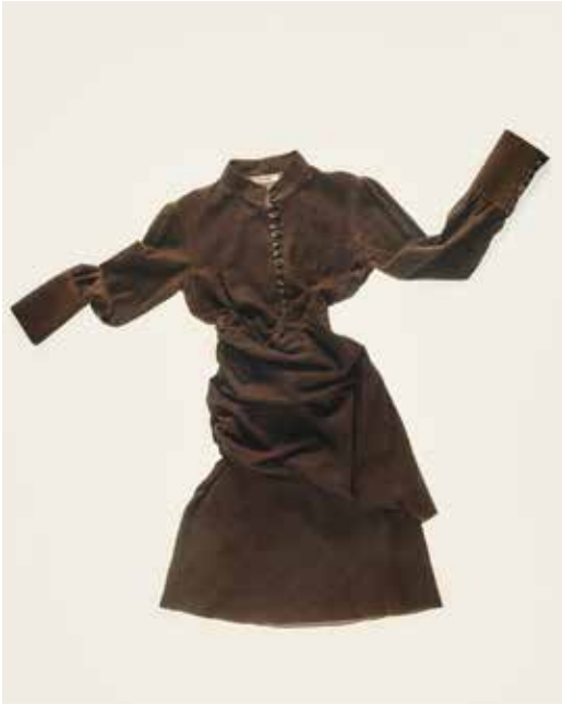
003- 06 MUD DRESS

MUD CLOTH - 100% LIGHT COTTON / 100% SEAWEED BUTTONS ONE SIZE ONLY - SMALL