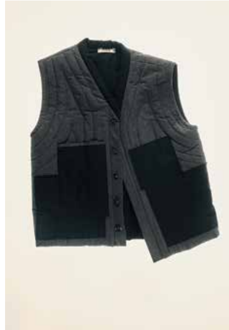
003- 08 WORKER POCKETS VEST

MIKKUSU JAPANESE FABRIC 85% RECYCLED COTTON 15% RECYCLED LINEN 100% SEAWEED BUTTONS ONE SIZE ONLY - MEDIUM