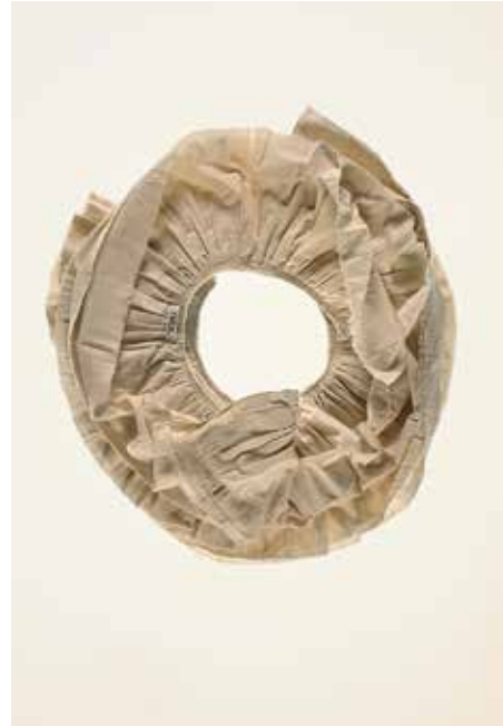
003- 17 RUFFLE SCARF

100% CALICO / 100% SEAWEED BUTTONS ONE SIZE ONLY - MEDIUM