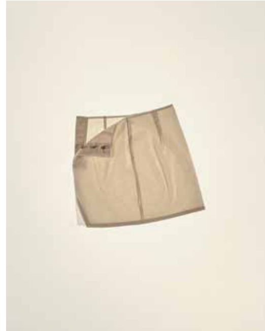
003- 27 SHORT SKIRT

100% CALICO / 100% SEAWEED BUTTONS ONE SIZE ONLY - SMALL