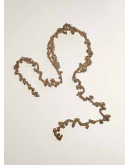
003- 04 MONARCA HAIRBAND

100% COTTON / 100% HEMP ONE SIZE ONLY - 40EU ART PIECE - DELICATE