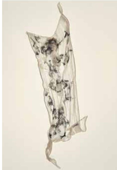
003- 34 FELTED MIXED SCARF

100% CALICO / 100% SEAWEED BUTTONS ONE SIZE ONLY - MEDIUM