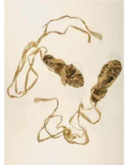
003- 40 THICK FLIP FLOPS

100% CALICO / 100% SEAWEED BUTTONS ONE SIZE ONLY - SMALL