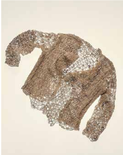
003- 31 HEMP JACKET