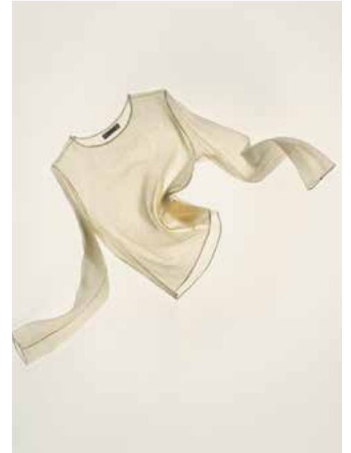
003- 10 BASIC TSHIRT

100% CALICO / 100% SEAWEED BUTTONS ONE SIZE ONLY - SMALL