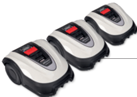
03 HRM 40 / 40 LIVE / 70 LIVE