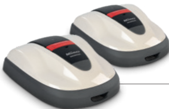
07 HRM 310 / 520