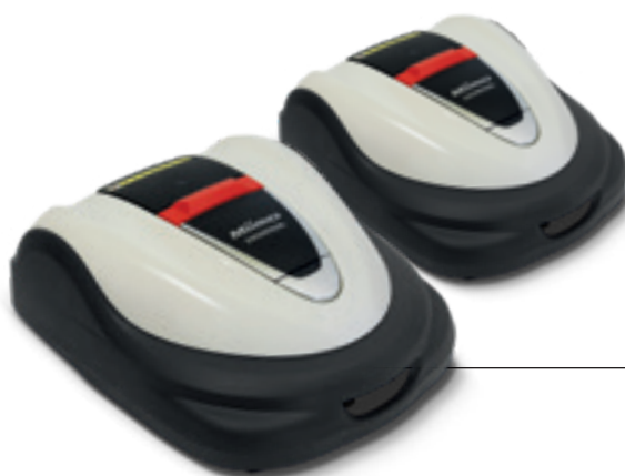
08 HRM 3000 09 HRM 3000 LIVE