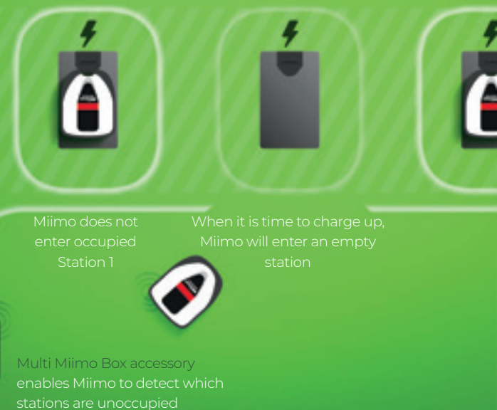
Diagram is for illustration purposes only, please consult your Honda dealer for installation.

When station is empty, it is no longer isolated from the mowing area