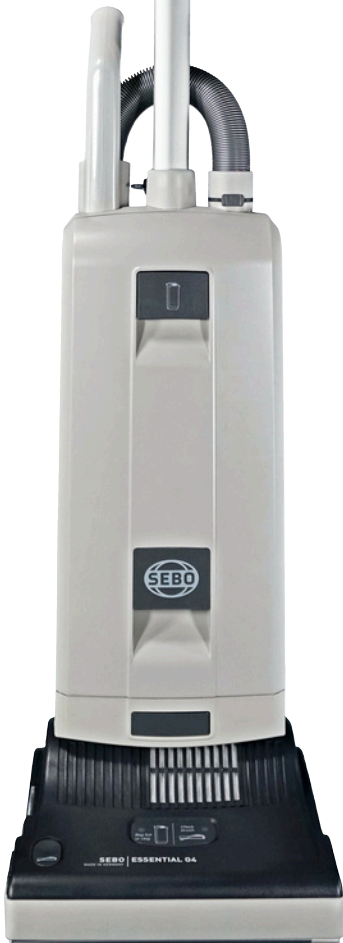
ESSENTIAL G4 Gray #90406AM