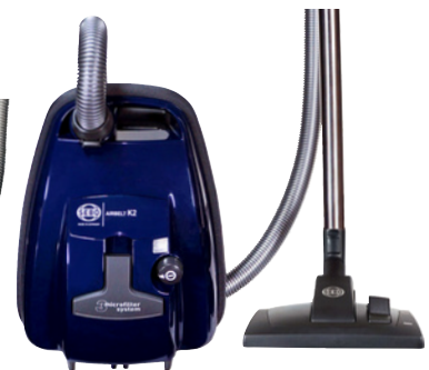
AIRBELT K2 Kombi Dark Blue with Combination Nozzle #9679AM