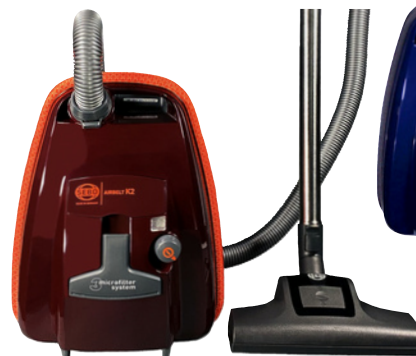
AIRBELT K2 Turbo Black Cherry with Turbo Head and Parquet Brush #9678AM