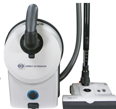
AIRBELT D4 Premium White with ET-1 and Parquet Brush #90941AM