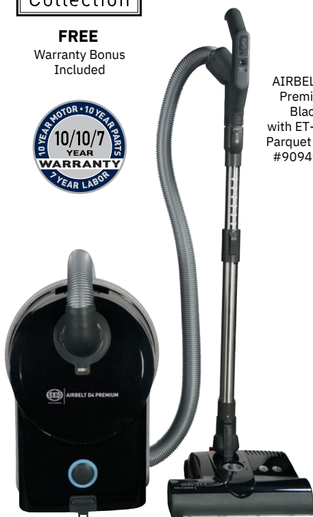
AIRBELT D4 Premium Black with ET-1 and Parquet Brush #90940AM

Three On-board Tools and a Parquet Brush are Included with All AIRBELT D models.