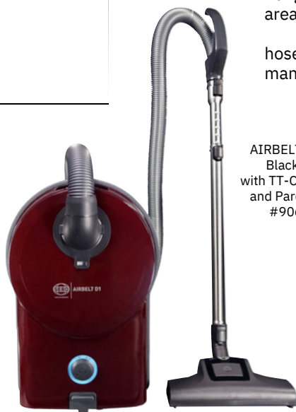
AIRBELT D1 Turbo Black Cherry with TT-C Turbo Head and Parquet Brush #90604AM