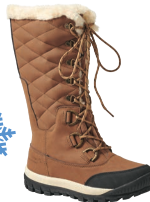
Isabella Boot $125; bearpaw.com