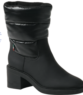
Snow Boot $185; francosarto.com