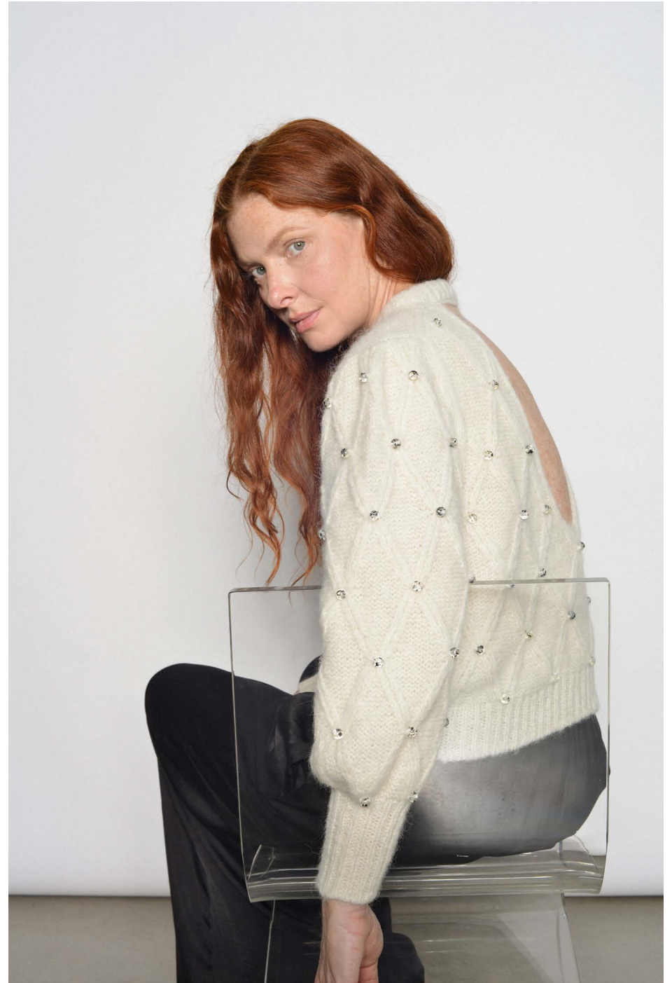
ZARIA SWEATER | ESPSP22-26 | IVORY W/ GRAPHITE BEADS