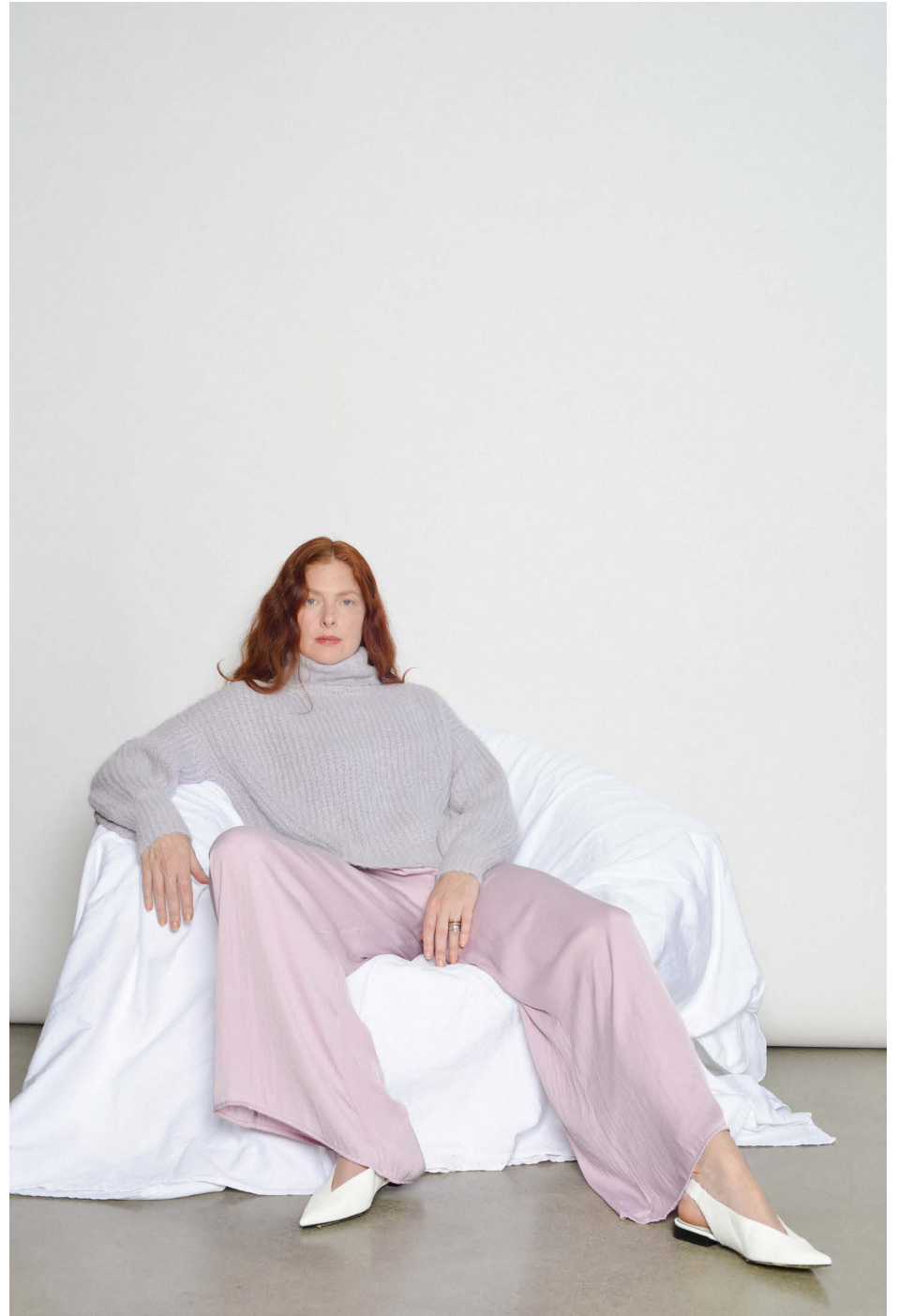
ALI SWEATER | ESPSP22-22 | LILAC (styled with woven pant)