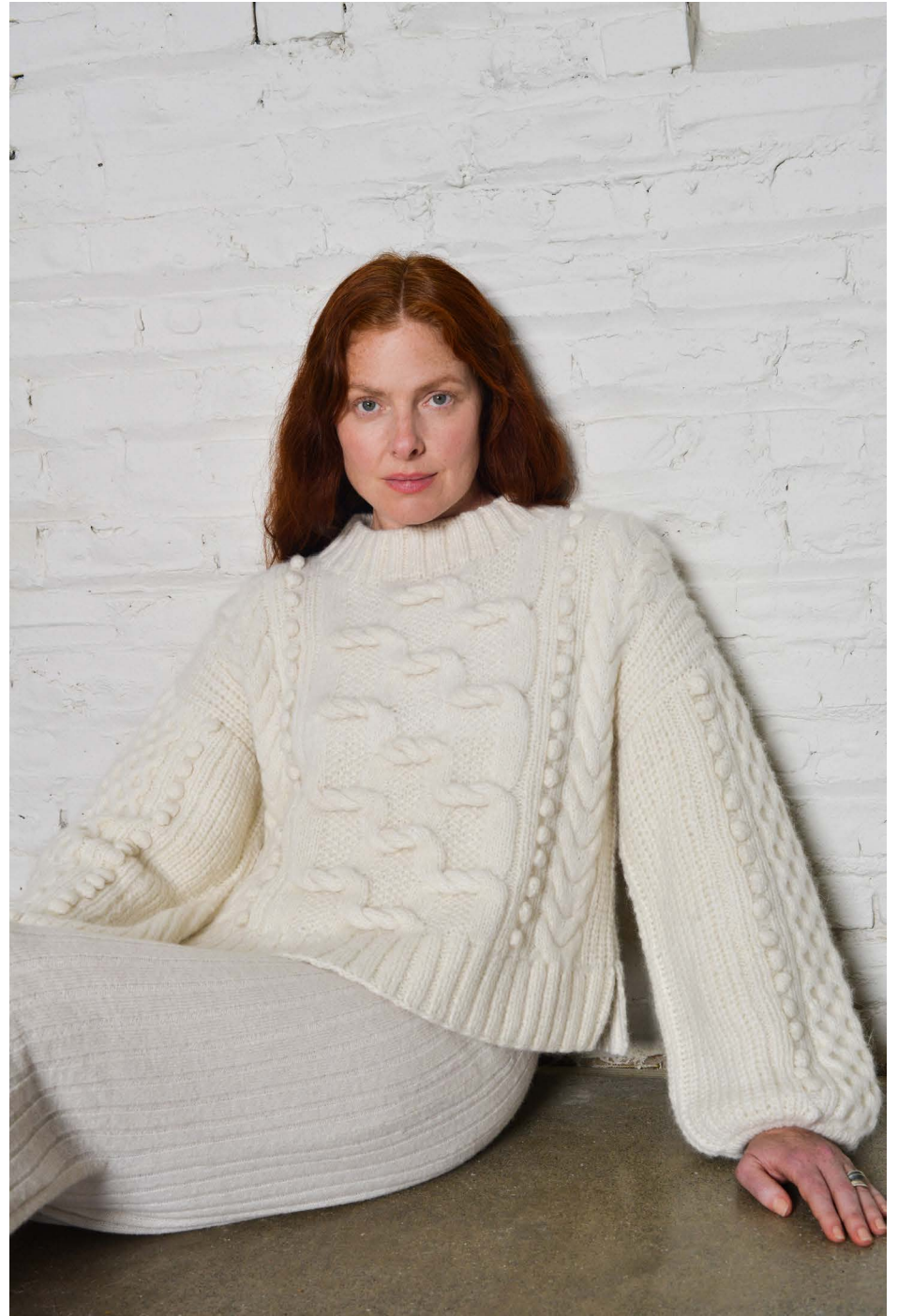
AURORA SWEATER | ESPSP22-11 | IVORY (layered over Leonie Dress)