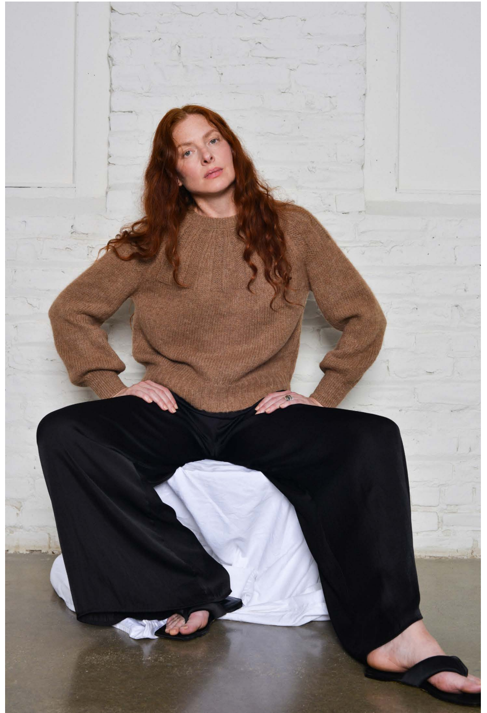
Mila Sweater | ESPSP22-24 | Camel (styled with woven pant)