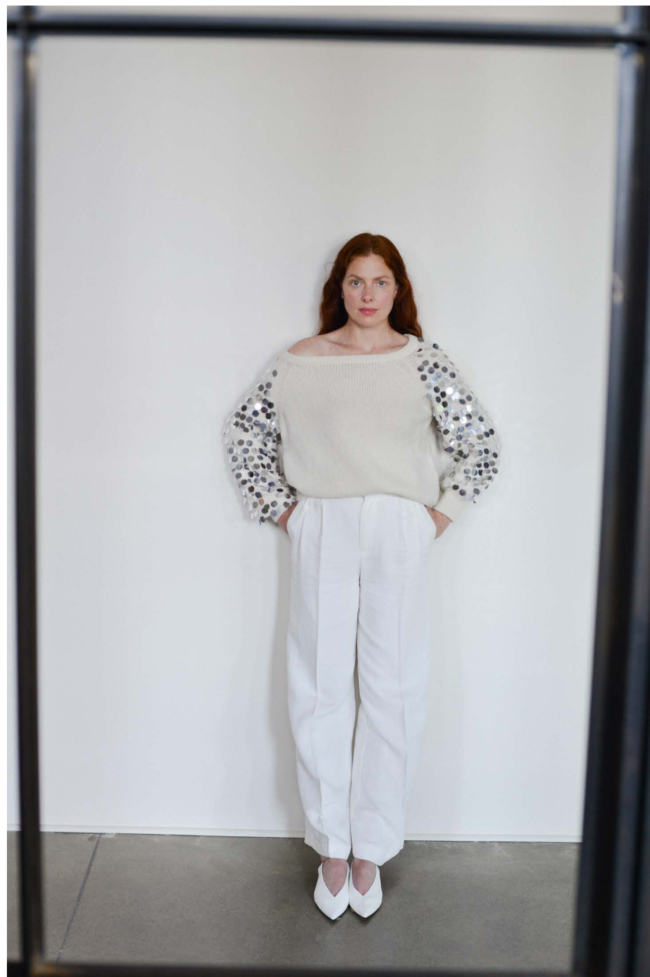
SADIE SWEATER | ESPSP22-15 | IVORY W/ SILVER SEQUINS (styled with woven pant)