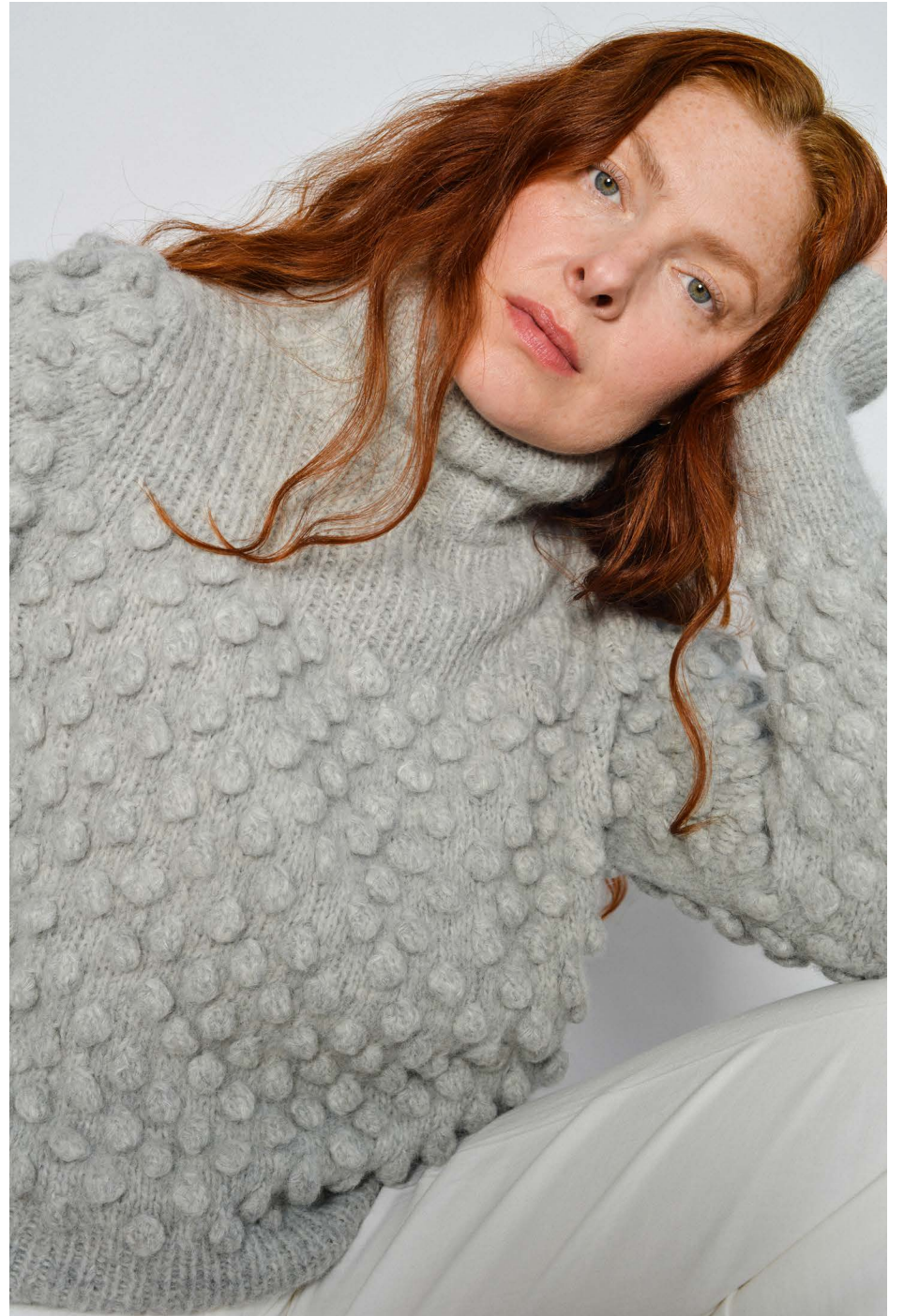
LUNA SWEATER | ESPSP22-10 | PALE GREY MELANGE