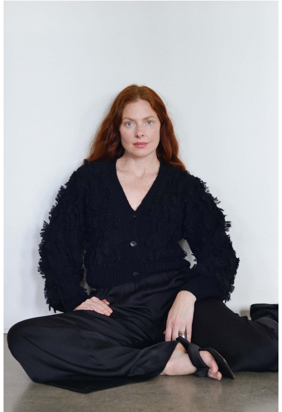
LUELLA CARDI | ESPSP22-02 | BLACK (styled with woven pant)