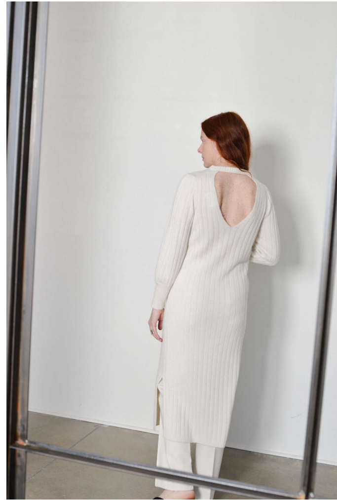
LEONIE DRESS | ESPSP22-13 | IVORY (layered over stylists woven pant)