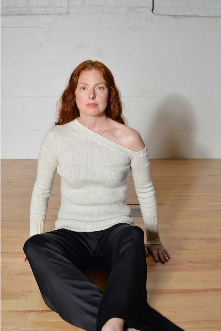
VALI SWEATER | ESPSP22-18 | IVORY W/ SILVER LUREX (styled with woven pant)