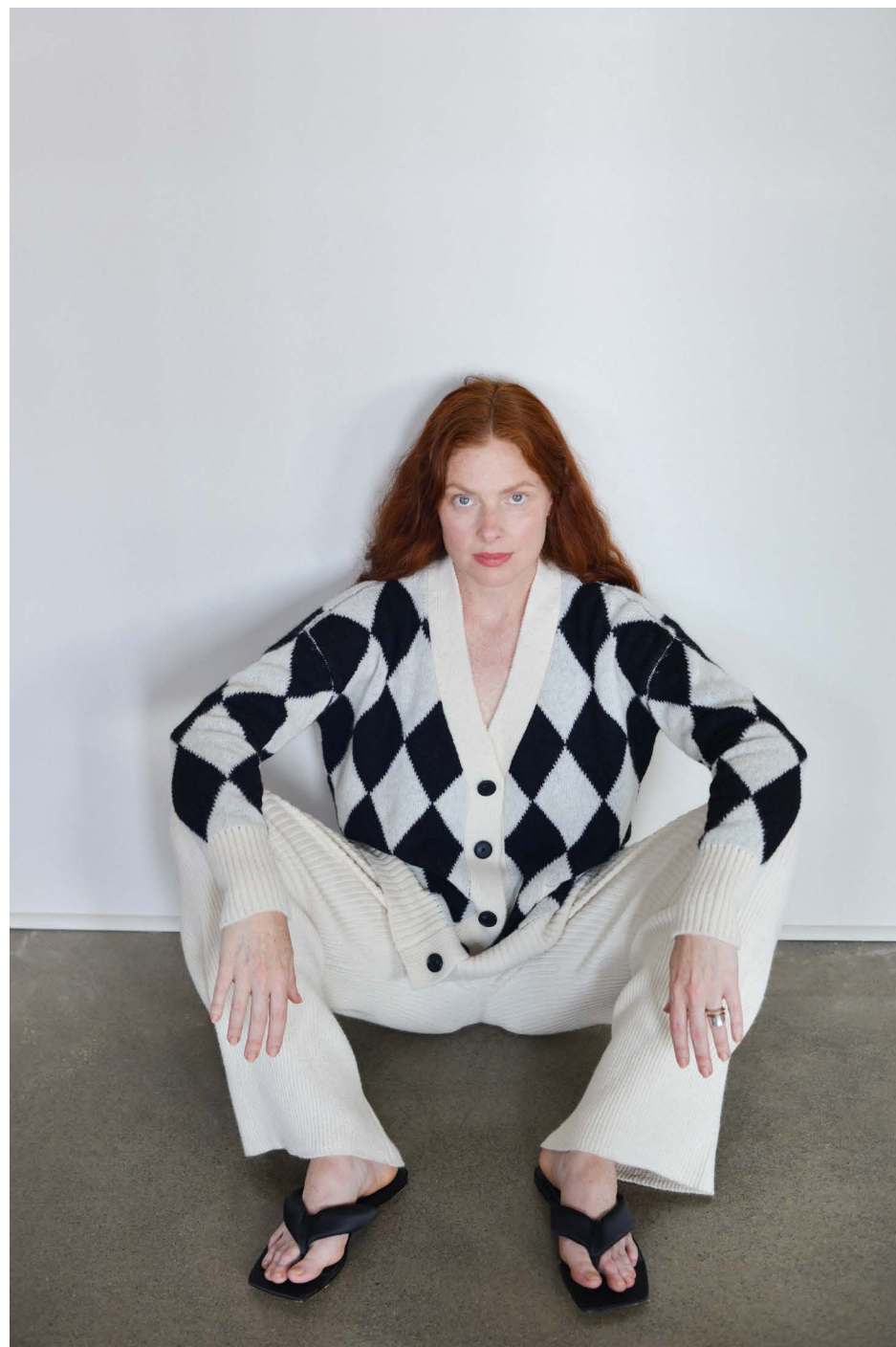
CARLA CARDI | ESPSP22-05 | IVORY & BLACK COMBO. MARLA PANT | ESPSP22-31 | IVORY