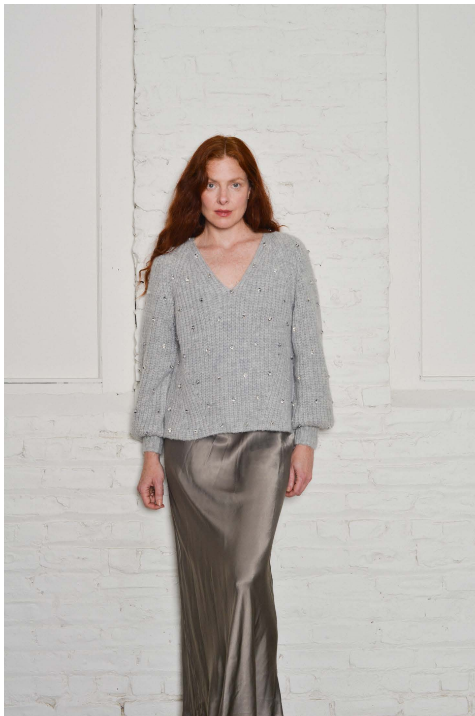
TESSA SWEATER | ESPSP22-25 | PALE GREY MELANGE (styled with woven slip dress)