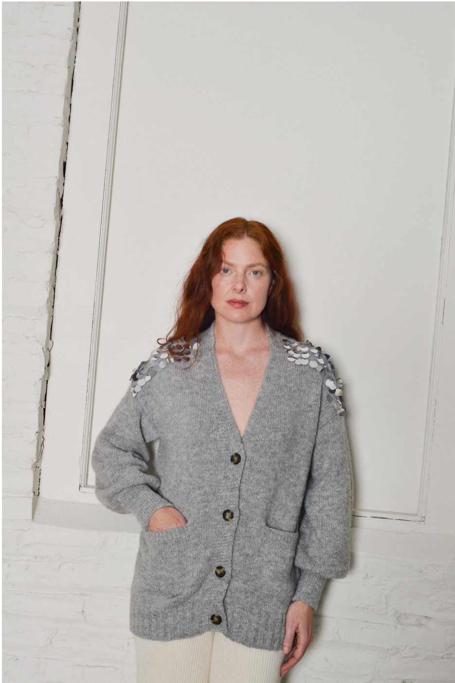
CORA CARDI | ESPSP22-23 | PALE GREY MELANGE W/ SILVER SEQUINS