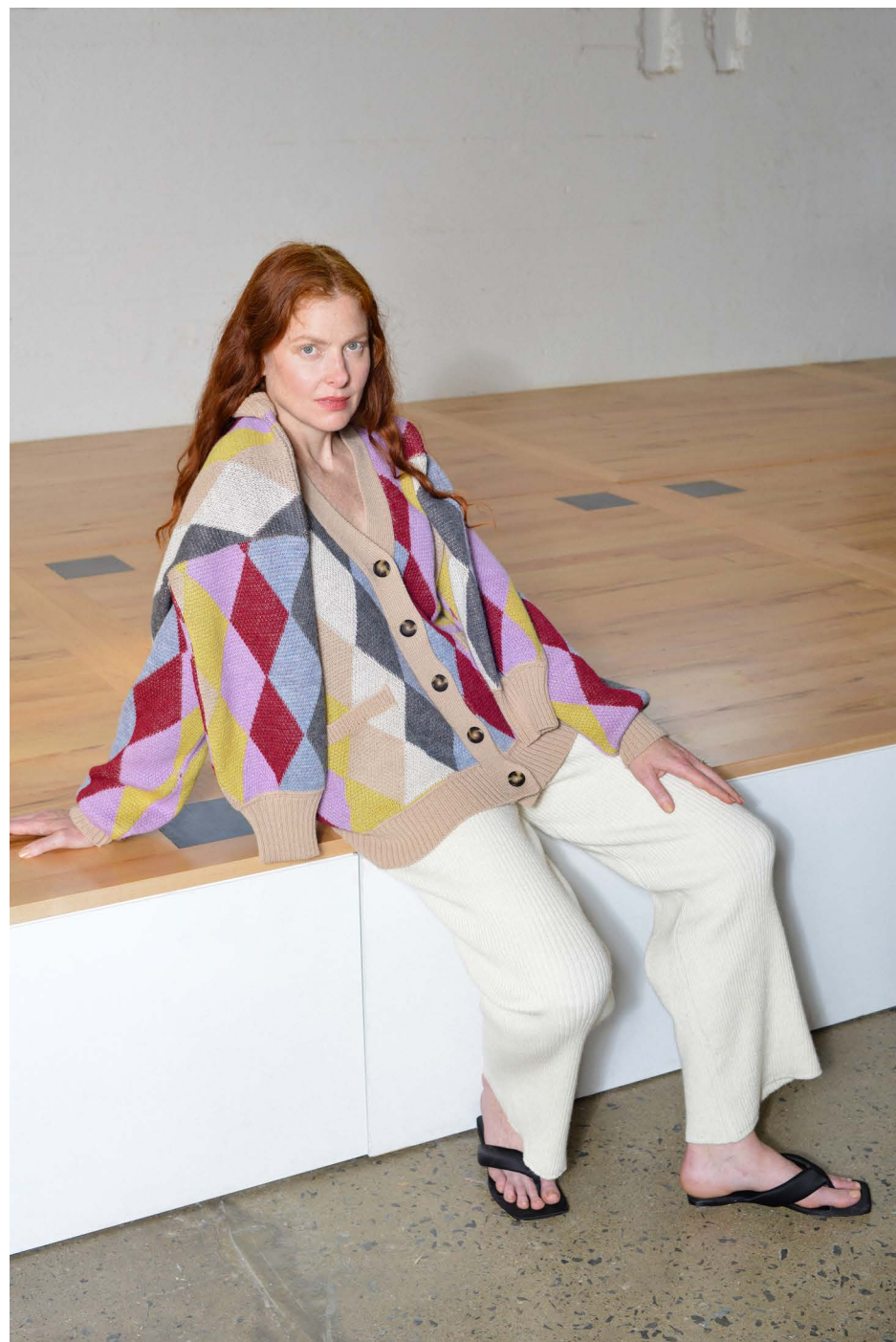
CARLA CARDI | ESPSP22-05 | MULTI COLOR (Faith Sweater layered over shoulder) MARLA PANT | ESPSP22-31 | IVORY