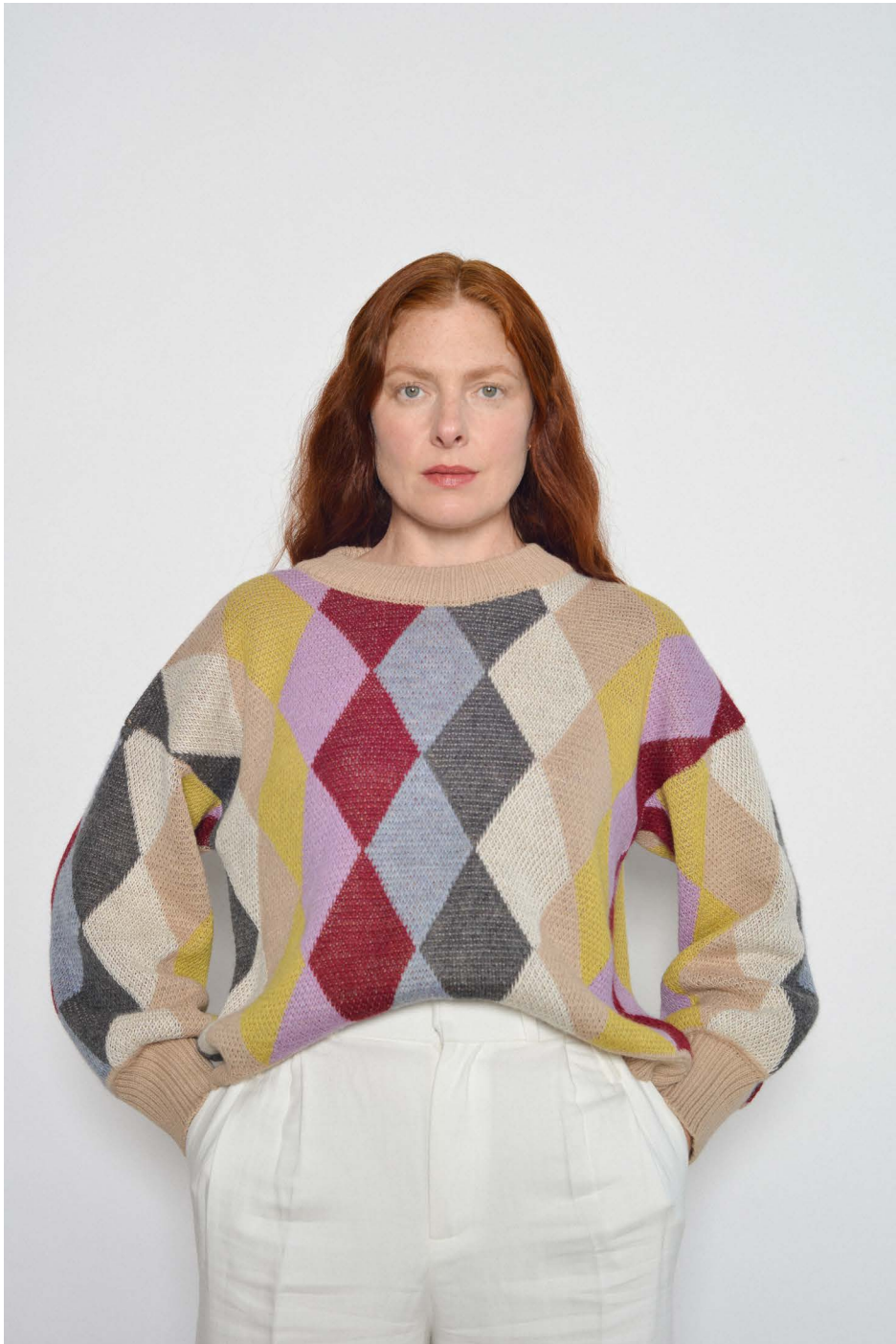
FAITH SWEATER | ESPSP22-06 | MULTI COLOR