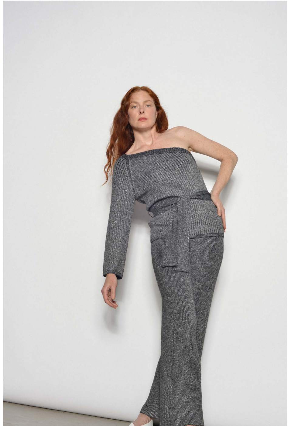
NOVA SWEATER | ESPSP22-14 + MARLA PANT | ESPSP22-31 GRAPHITE MELANGE W/ LUREX