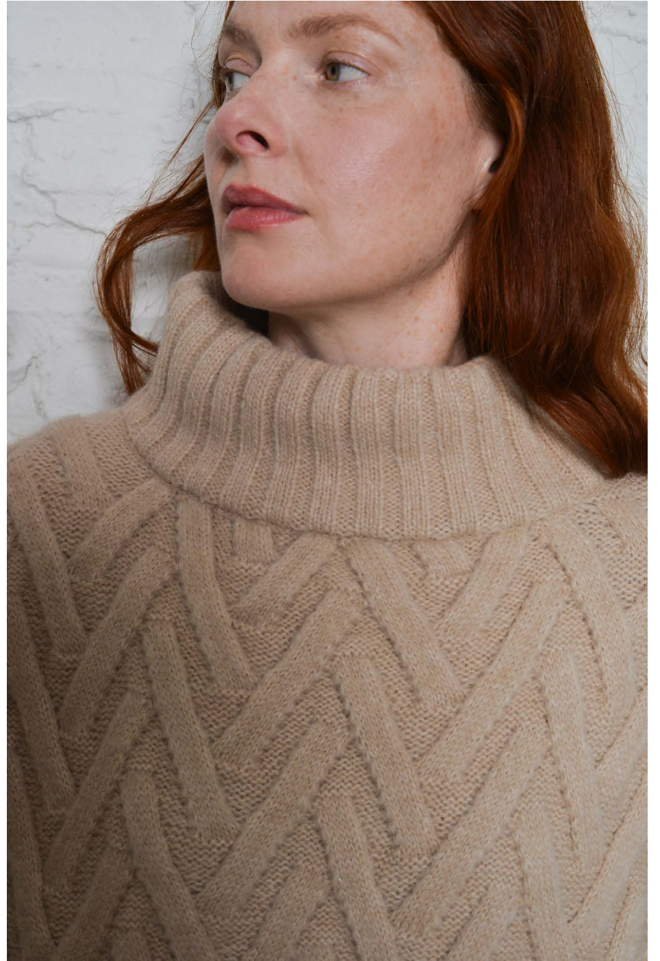
BETHANY SWEATER | ESPSP22-22 | PALE CAMEL (styled with woven pant)