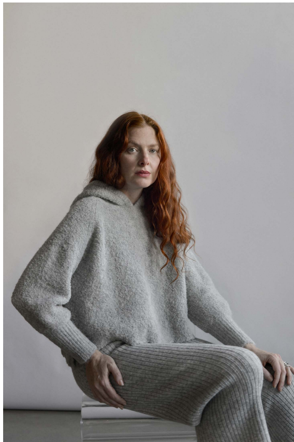
JENN HOODIE | ESPSP22-07 | PALE GREY MELANGE LEAH PANT | ESFW21-09 | PALE GREY MELANGE