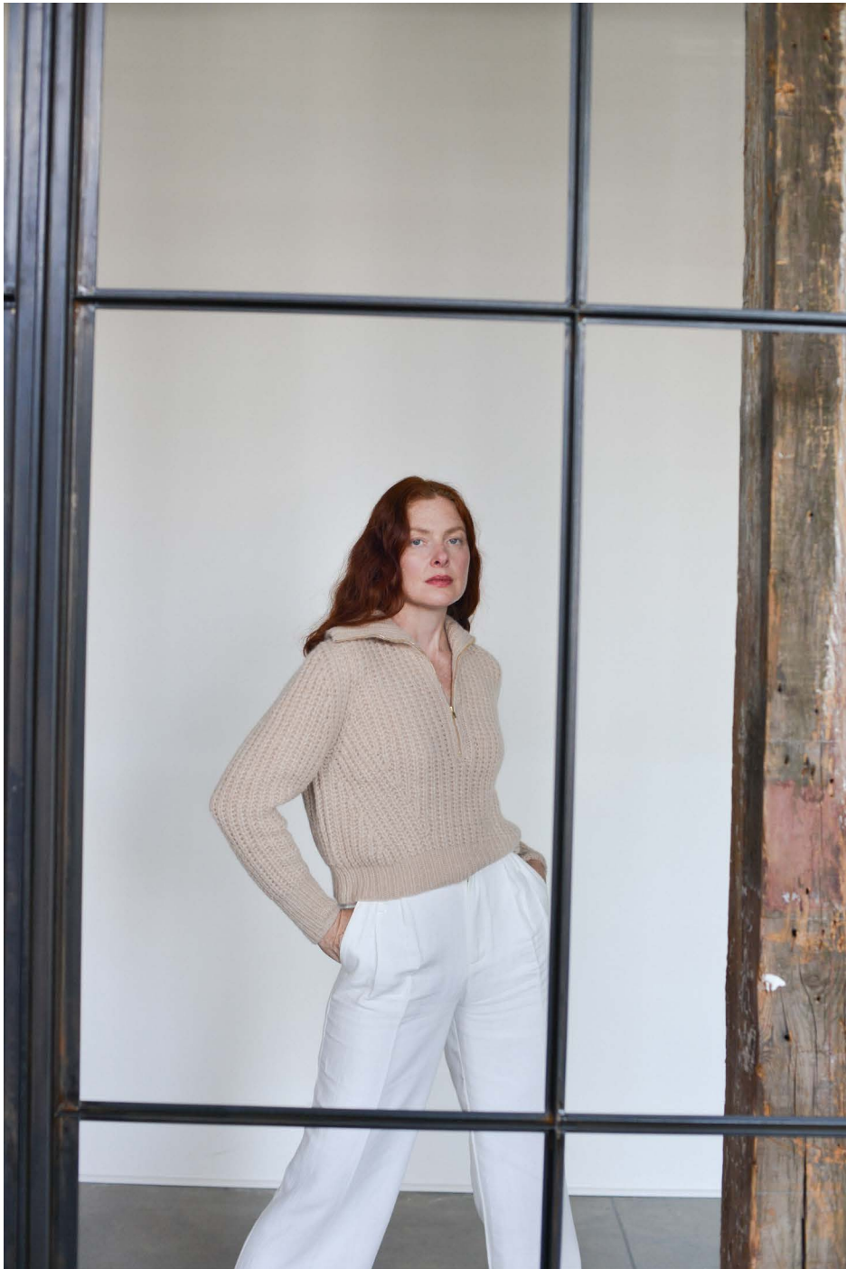
JAMIE SWEATER | ESPSP22-19 | PALE CAMEL (styled with woven pant)