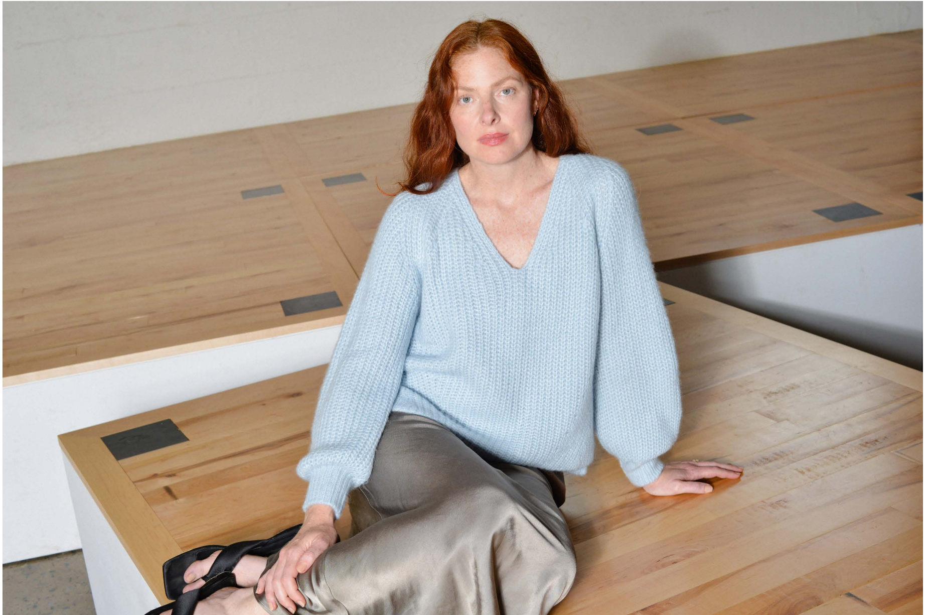
TESS SWEATER | ESPSP22-08 | POWDER BLUE (styled with woven slip dress)