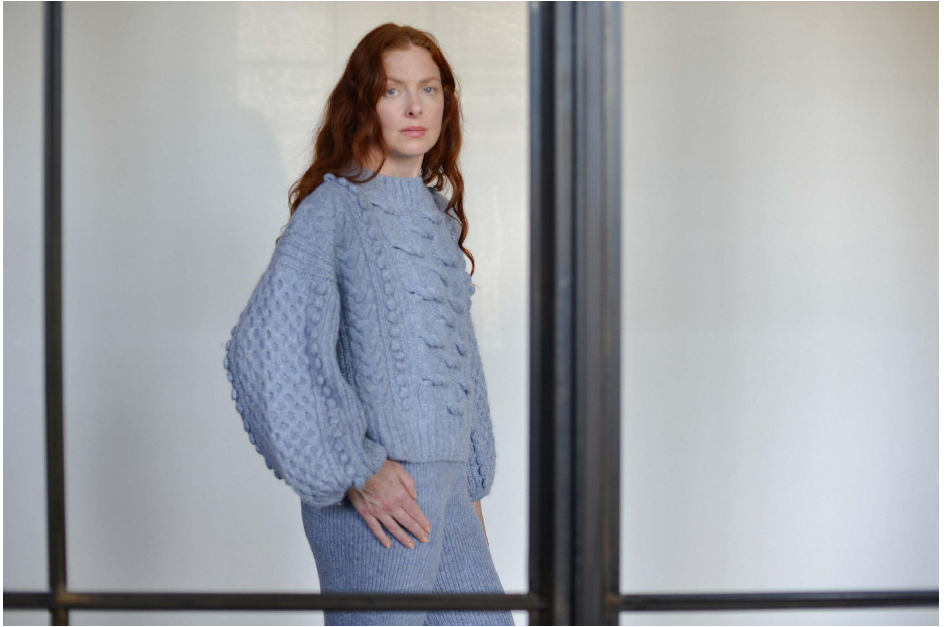
AURORA SWEATER | ESPSP22-11 | CLOUD BLUE MARLA PANT | ESPSP22-31 | CLOUD BLUE