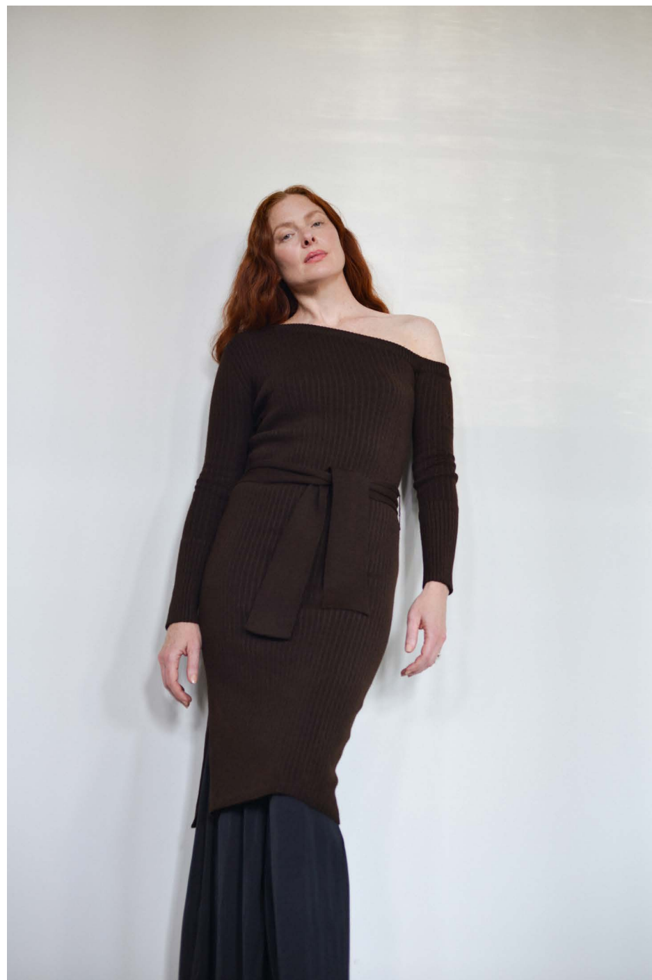
ANA DRESS | ESPSP22-21 | ESPRESSO (layered over stylist's woven pant)