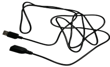
USB Extension Cable (x1)