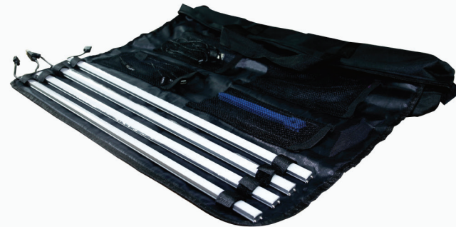
Soft Case Included (x1)