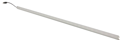
USB LED Light Strips (x4)

Please contact support@tradeshowplus.com Visit: www.tradeshowplus.com