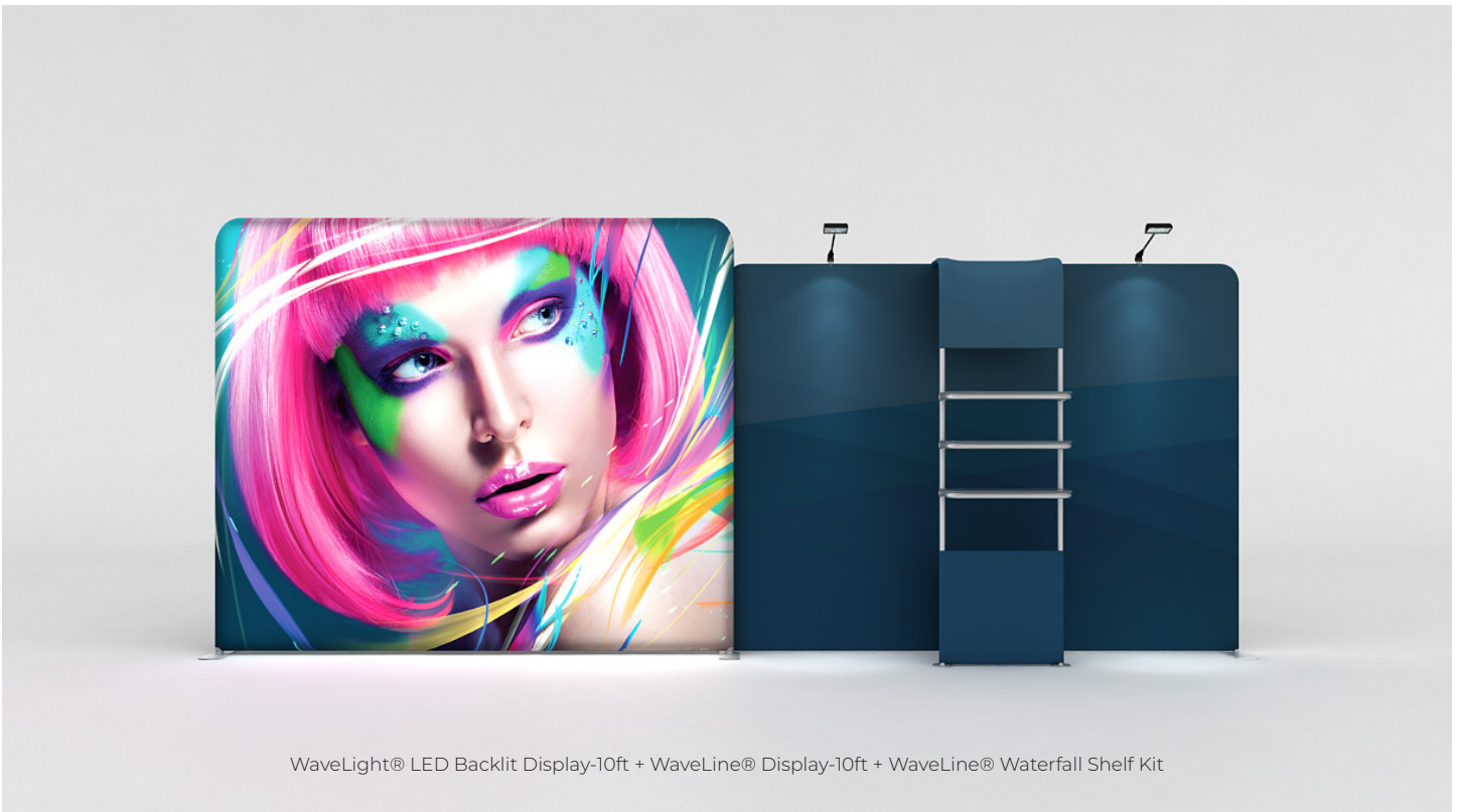
WaveLight® LED Backlit Display-10ft + WaveLine® Display-10ft + WaveLine® Waterfall Shelf Kit