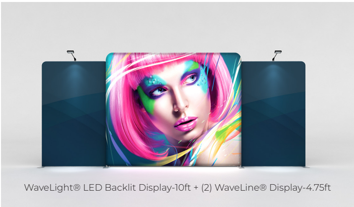
WaveLight® LED Backlit Display-10ft + (2) WaveLine® Display-4.75ft