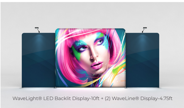
WaveLight® LED Backlit Display-10ft + (2) WaveLine® Display-4.75ft