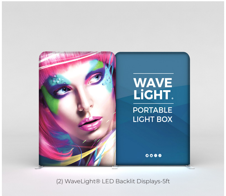
(2) WaveLight® LED Backlit Displays-5ft

The WaveLight® Display product line is an extremely versatile collection. We take pride in providing our customers with endless display solutions. WaveLine® Media products are a great option to add your own custom environment with monitors, brochure holders, counters and many more creative solutions.