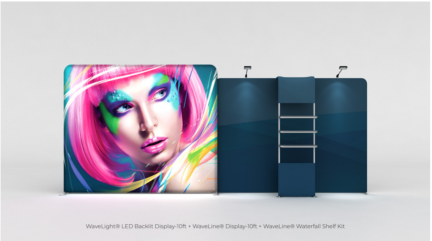
WaveLight® LED Backlit Display-10ft + WaveLine® Display-10ft + WaveLine® Waterfall Shelf Kit