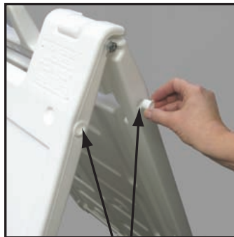
Sand Fill Holes

Each sign frame has four fill holes, two on each side of the frame.