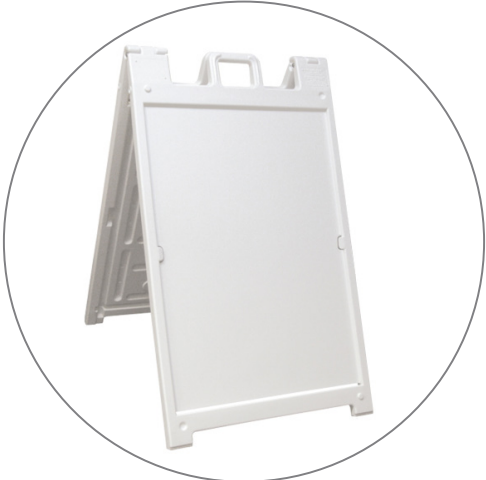
Signicade Deluxe (qty 1)