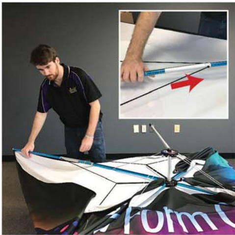
Unfold arms and lock spring loaded sliders