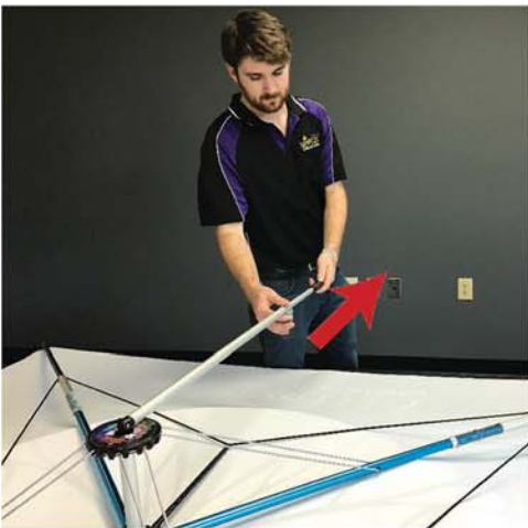
Extend the telescoping leg