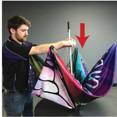
Unfold unit by pushing hub toward table