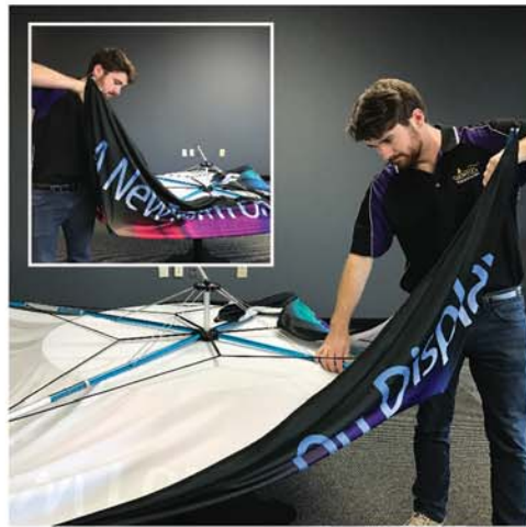
Unfold remaining arms locking the sliders