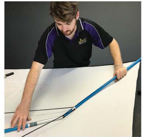
Unfolding last arm stretches fabric tight