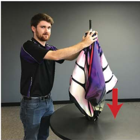
Set ShowFlex upright on table