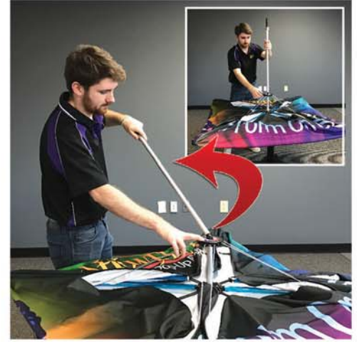
Pivot telescoping leg 90° to lock hub.