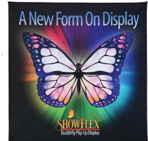
Ready to show! Patent Pending

IMPORTANT: Pivot telescoping leg 90 degrees to lock the hub in place BEFORE unfolding the arms of the ShowFlex.