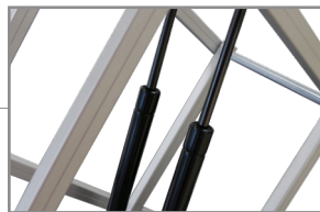
Patented hydraulic cylinder design