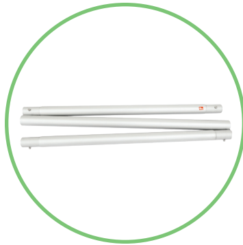
QTY 1: Bottom Horizontal Tube Set