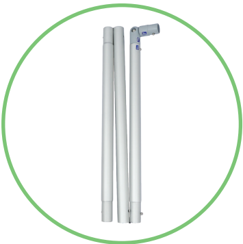
QTY 2: Vertical Tube Sets