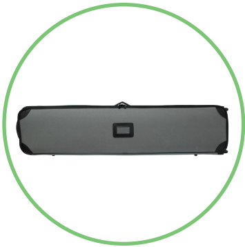
QTY 1: Silverbag