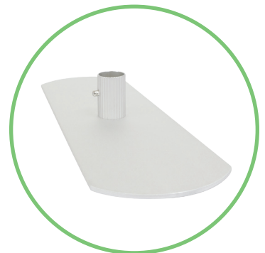
QTY 2: Feet