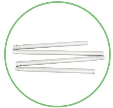
QTY 1: Top Horizontal Tube Set