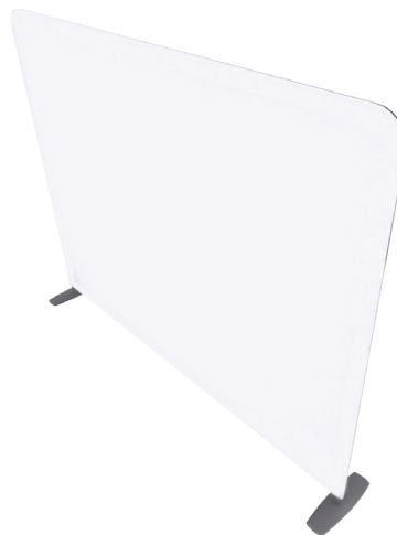
Single-Sided Back View