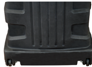
Recessed wheels & handles