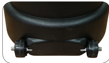
Recessed wheels and handle