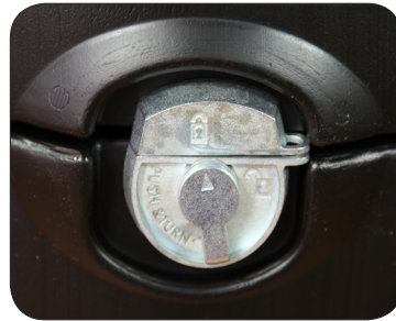
Push & turn locking mechanism