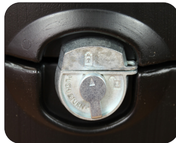
Push & turn locking mechanism