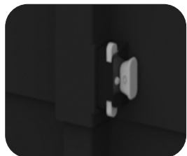
Close up of latch