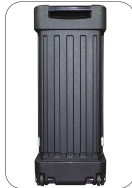
Handle and wheels