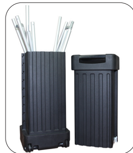
Case fits with Formulate tubes and graphics