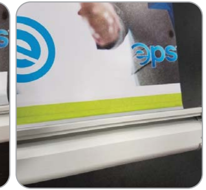
Apply tape to the bottom front of the graphic for extra re-enforcement.