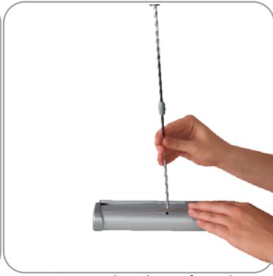
Secure pole to base of stand.