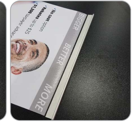
Apply graphic so that its even on both sides.