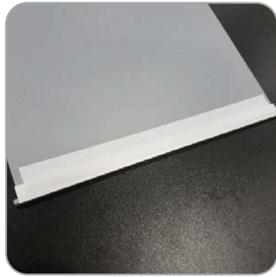
Take the re-enforcing tape and apply to the back of the banner and rail making sure there is even coverage between the two.