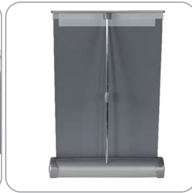
Unit is complete. Back view.