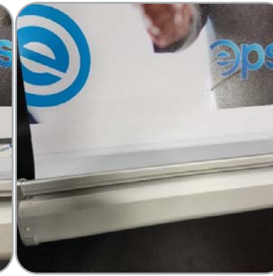
Mount graphic to leader strip evenly making sure there is one 1/2" of overlap.