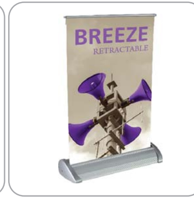
Unit is complete.