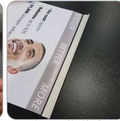
Line up graphic with rail.