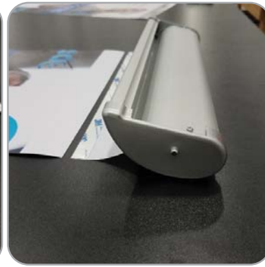
Have banner stand upside down. This keeps leader strip from curling up.