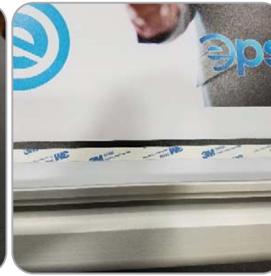
Line up graphic with leader strip.