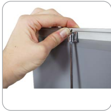
Pull up graphic and secure to poles.