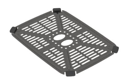
The crisping tray