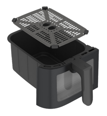
The frying basket and crisping tray (2x)