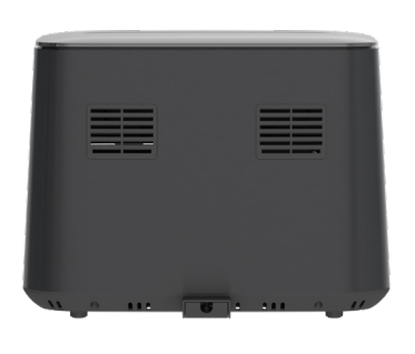
The air inlet/outlet