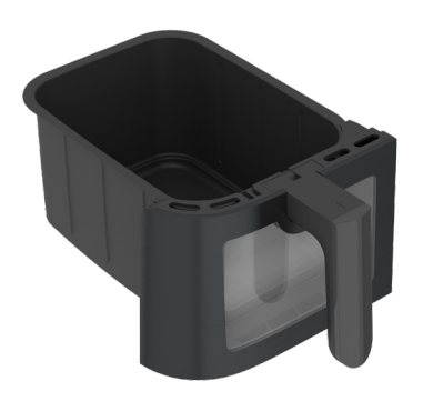
The frying basket