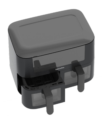
The airfryer body