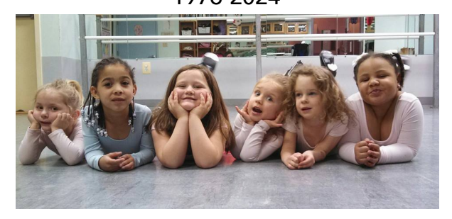
Ballet • Tap • Jazz • Lyrical • Pointe Ages 3 to Adult