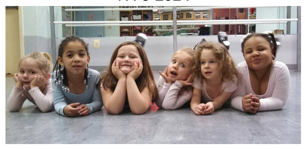
Ballet • Tap • Jazz • Lyrical • Pointe Ages 3 to Adult All Levels: Beginner to Advanced