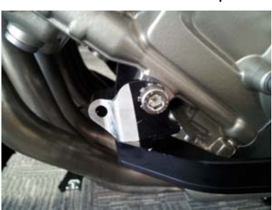
Left-side mounted - Close Up