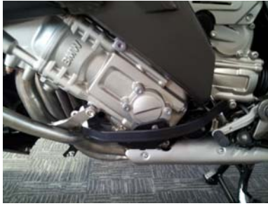
Left-side mounted - with Tip Over