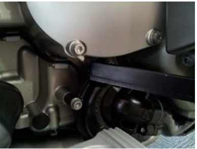
Right-side tail - Close Up