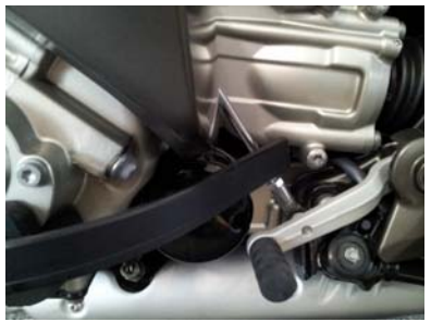
Left-side tail - Close Up