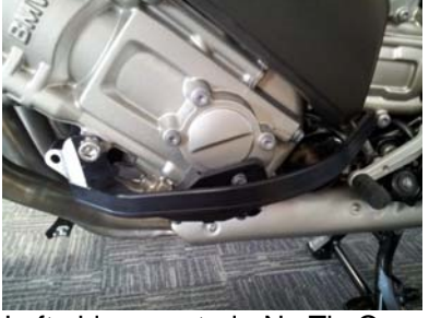
Left-side mounted - No Tip Over