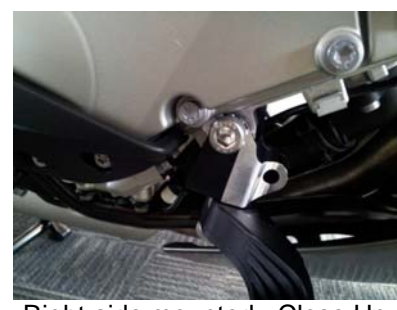
Right-side mounted - Close Up