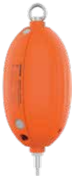
LR35127 EM BATTERY BACKUP